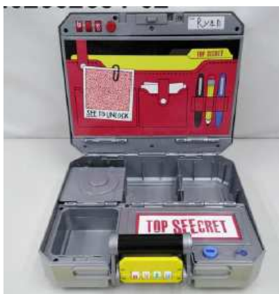
Figure & Accessories: