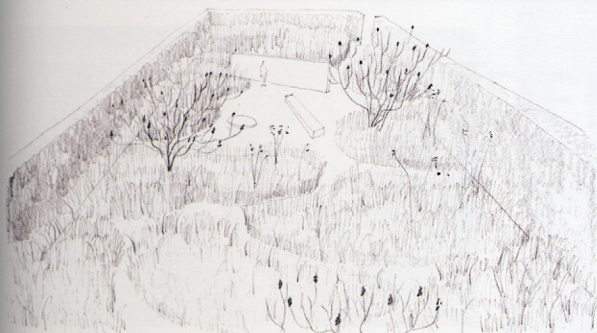
Drawings: Tom Stuart-Smith