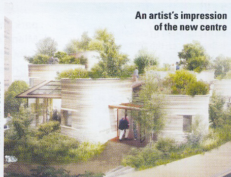
An artist's impression of the new centre

Marie-Louise's concept for the landscape design was generated from the topography, building form, access and views. "At present the site is a tiny island of green, sterilised by mowing and located within a comprehensive blanket of building," Marie-Louise explains. "But with the enriching ecology of woodland as a prime generator of the overall design, and with new planting at both ground level and on the roof, the site will become an oasis in the concrete desert." The site's biodiversity will be greatly increased by native species, including birches, sessile oaks and an understorey of shrubs and spring bulbs. www.balstonagius.co.uk , www.heatherwick.com