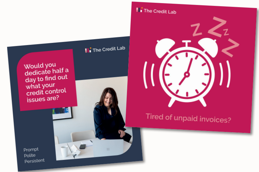
Examples of social media graphics created for The Credit Lab: https://www.linkedin.com/in/mel-thecreditlab/

*Deliverables agreed at initial meeting.