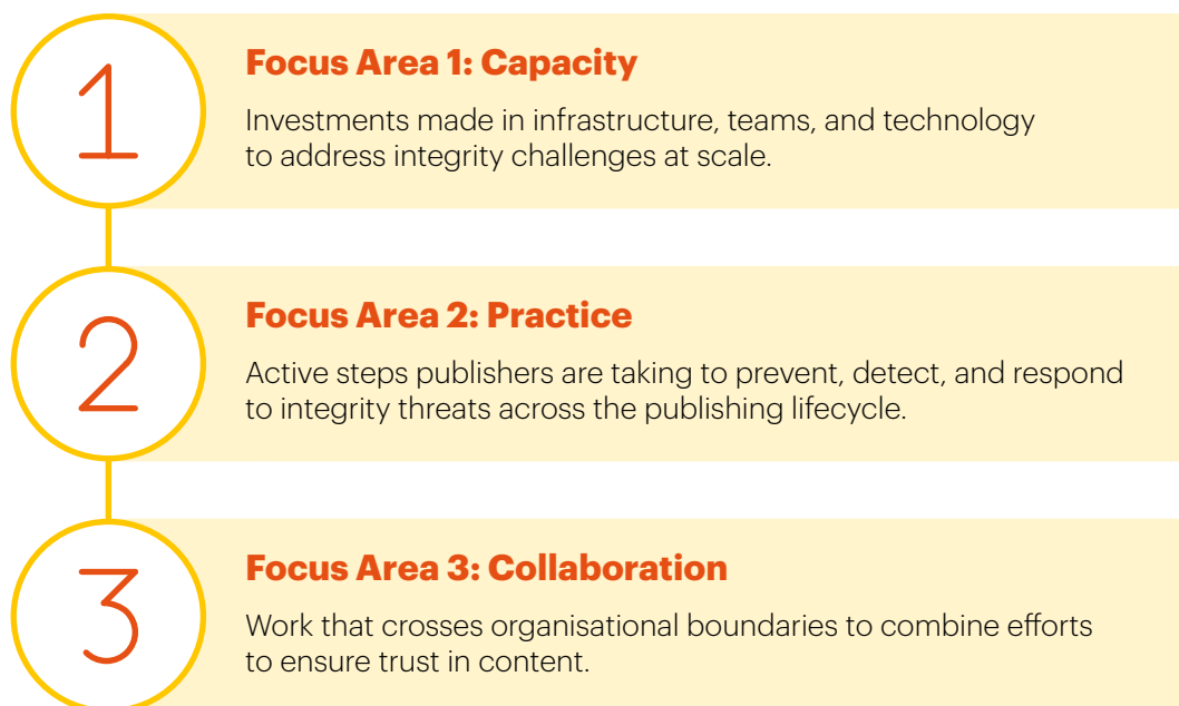
Figure 2: Three focus areas the project aimed to capture.

This report synthesises insights from 18 research integrity and publishing experts across 13 organisations, ranging from major commercial publishers to society and community-based publishers (see Appendix A ). This report includes quotes from these conversations as well as anonymised case studies that illustrate the breadth and depth of the efforts being put into place.