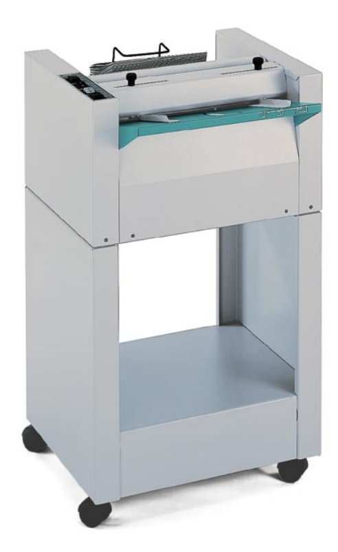
NAGEL FOLDNAK M2.