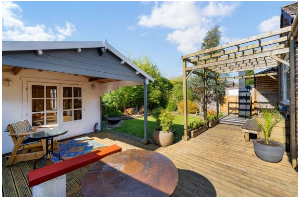
Summer House/ Shed