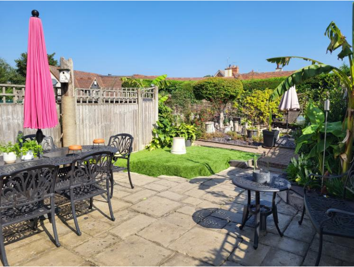
Vendors photos taken in summer of garden.