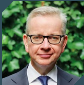
Lord Michael Gove

Former Secretary of State for Levelling Up, Housing and Communities