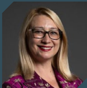
Jess Asato MP