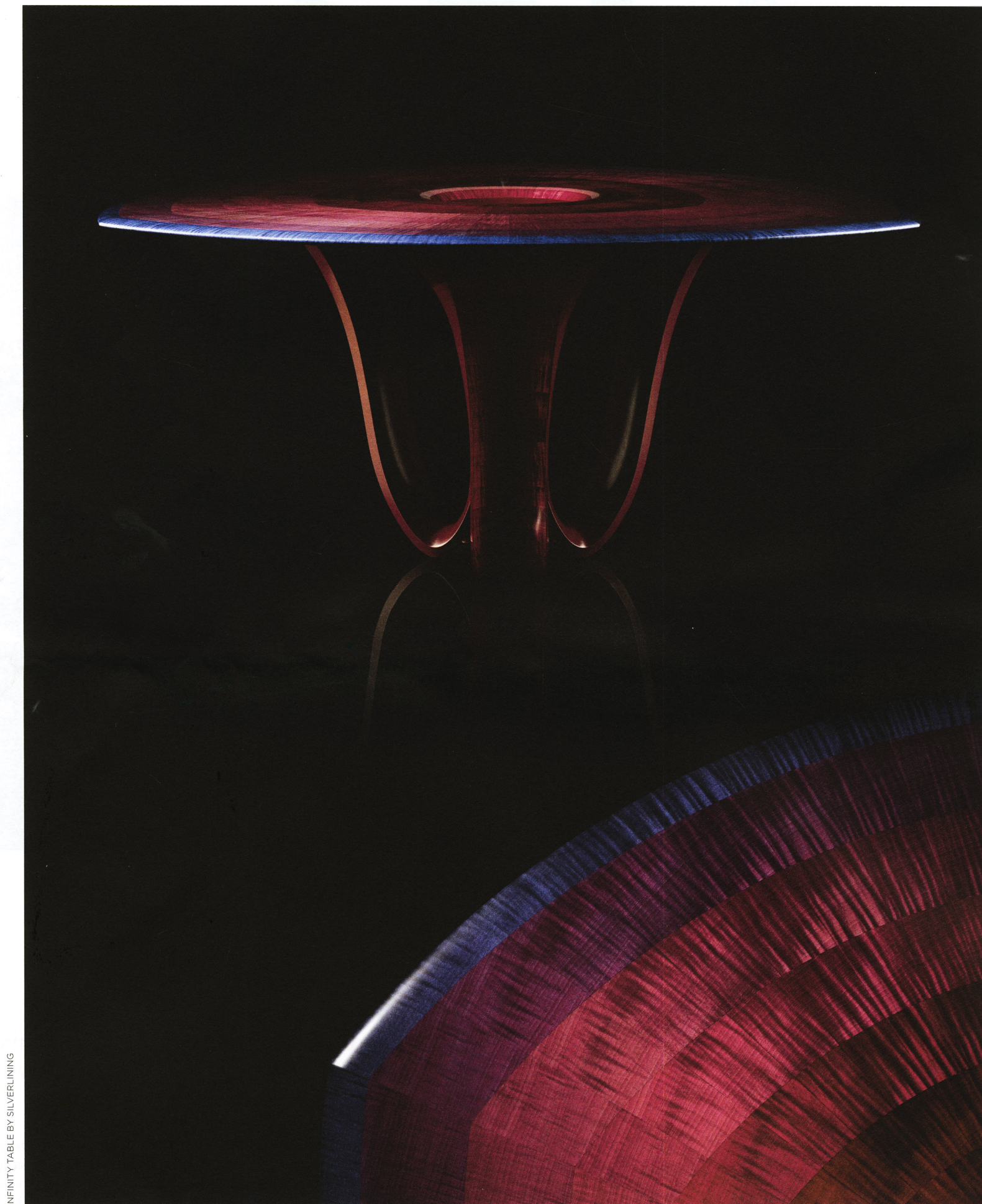
INFINITY TABLE BY SILVERLINING