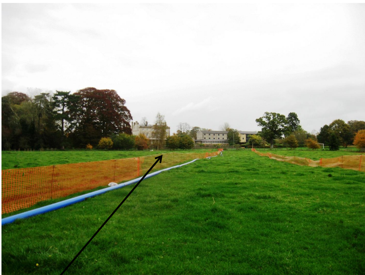
Approx location old Lackham House (demolished 1793-1795)