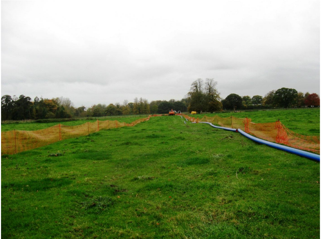
Looking south west along the line of the pipeline before operations commenced