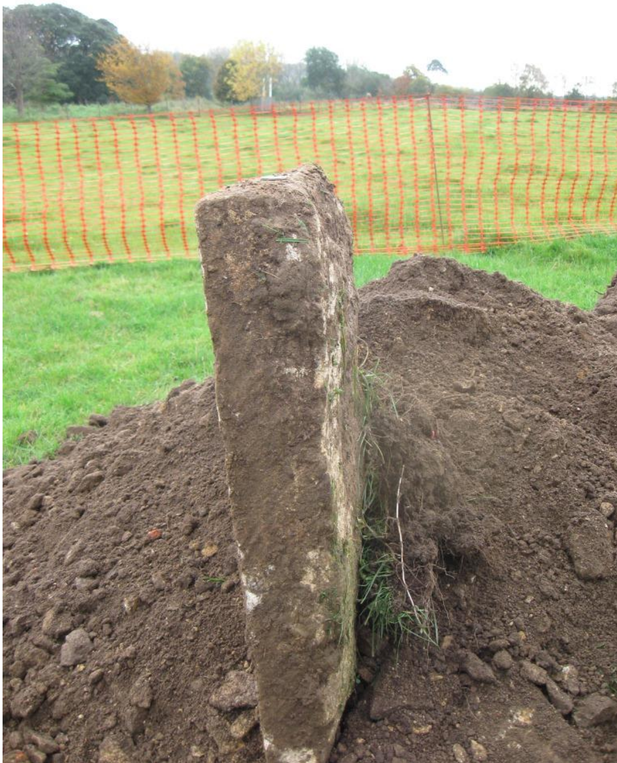
Large blocks were found at ST92239 70046 these were located 55.4m from the north east end of the trench at the gateway into the Sports Field