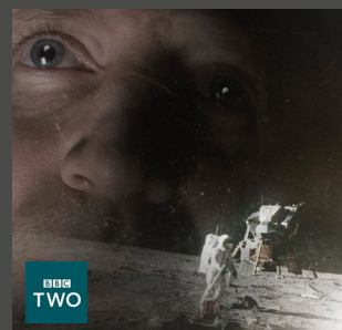
8 DAYS: TO THE MOON AND BACK

Use these websites to help you with the tasks below and develop your understanding of the sector: