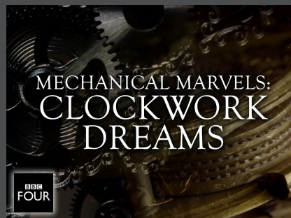
MECHANICAL MARVELS: CLOCKWORK DREAMS