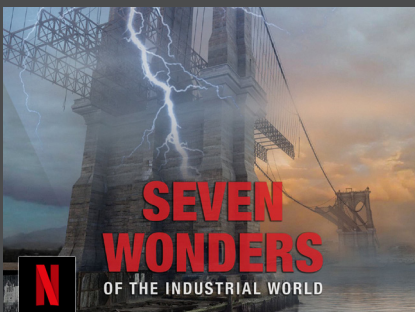
SEVEN WONDERS OF THE INDUSTRIAL WORLD

Watch one (or more!) of the documentaries below feats of engineering: Available on BBC iPlayer, UKTV Play or Netflix.