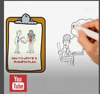
HOW TO WRITE A BUSINESS PLAN TO START YOUR OWN BUSINESS

Use these websites to help you with the tasks below and develop your understanding of the sector: