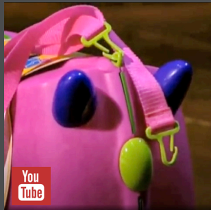
TRUNKI ON DRAGON'S DEN