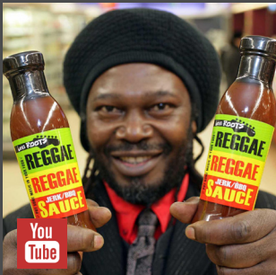
REGGAE REGGAE SAUCE CATCHUP - DRAGON'S DEN

Watch the following videos from YouTube: