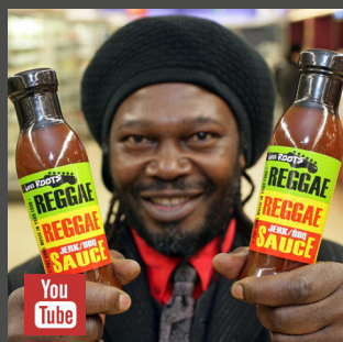
REGGAE REGGAE SAUCE CATCHUP - DRAGONS' DEN