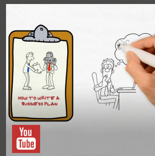
HOW TO WRITE A BUSINESS PLAN TO START YOUR OWN BUSINESS

Use these websites to help you with the tasks below and develop your understanding of the sector: