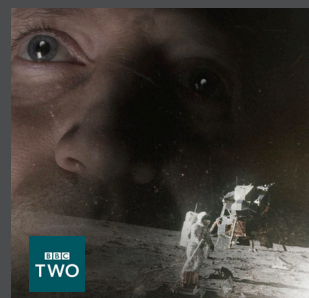
8 DAYS: TO THE MOON AND BACK

Use these websites to help you with the tasks below and develop your understanding of the sector: