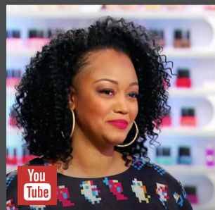
NAIL'D IT: EXTENDED FIRST LOOK | QUICK DRY CHALLENGE | OXYGEN