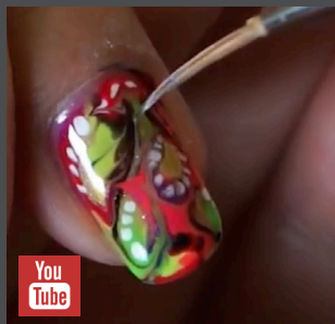
ARTISTIC COLOUR GLOSS ADVANCED NAIL ART: RETRO COLOUR COLLAGE