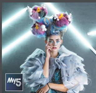
EXTREME HAIR WARS