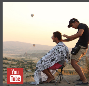
THE NOMAD BARBER