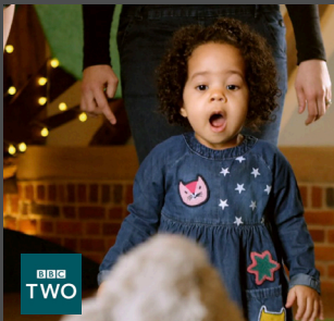
BABIES - THEIR WONDERFUL WORLD