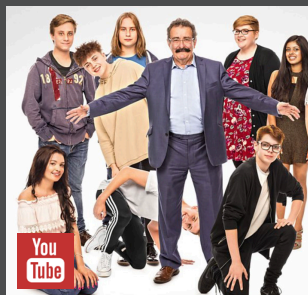
CHILD OF OUR TIME