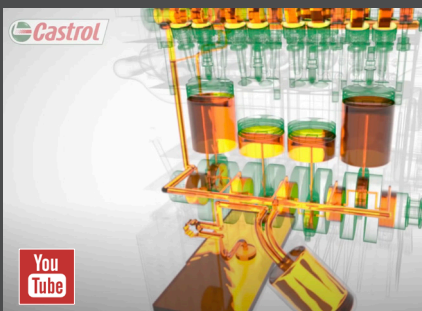
HOW DOES CAR ENGINE OIL WORK? CASTROL

Have a look at the following videos for a taste of the kind of systems and technology you will learn about on the motor vehicle courses.