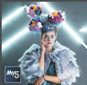
EXTREME HAIR WARS