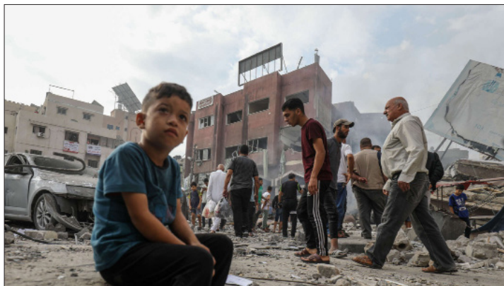
The result of British support and arms for the genocide in Gaza.