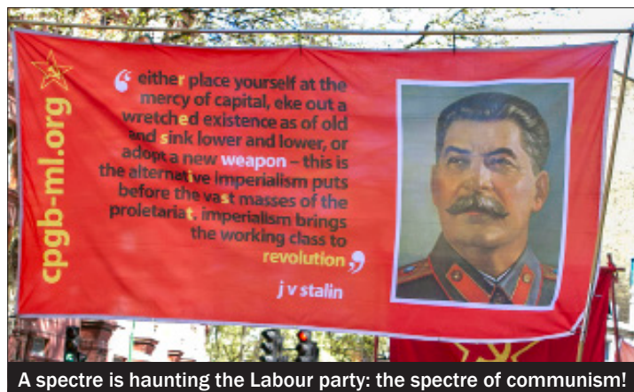
A spectre is haunting the Labour party: the spectre of communism!