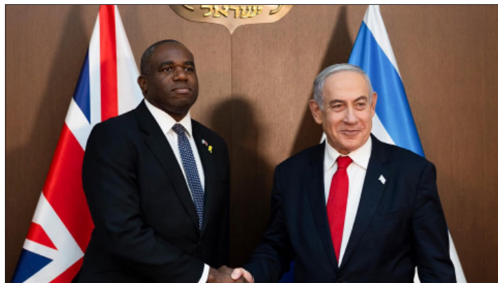
Labour foreign minister 'proud' to serve the genocidal regime.