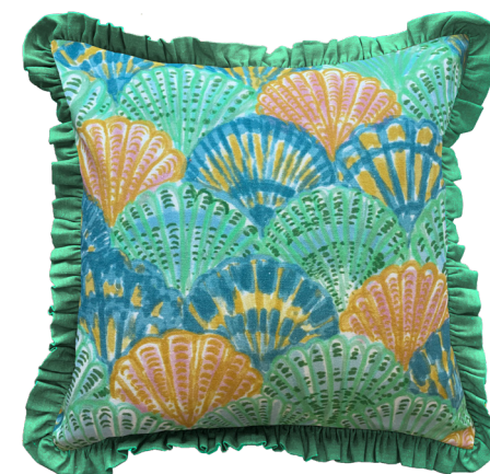
GREEN 50 x 50 cm