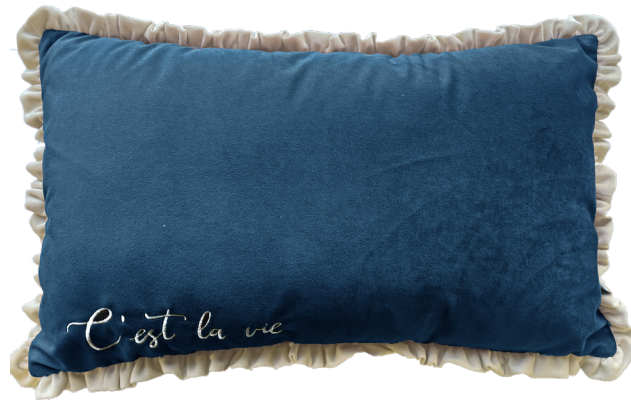
NAVY 30 X 50 CM