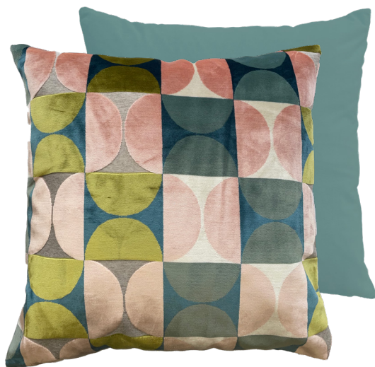
BARDOT Pink/Avo Green 50 x 50 cm