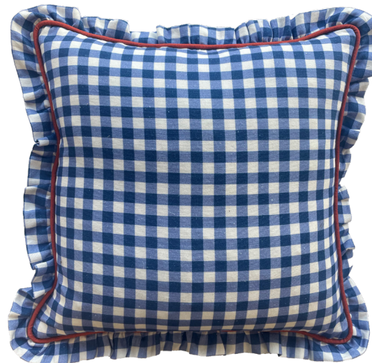
BLUE 45 x 45 cm