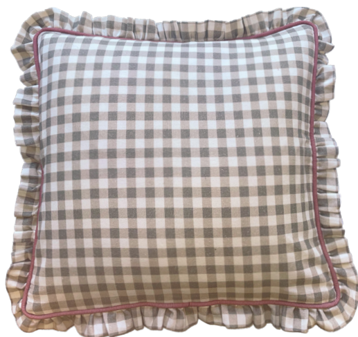
SAGE 45 x 45 cm