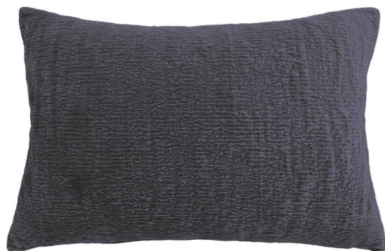
FLINT GREY 40 x 60 cm