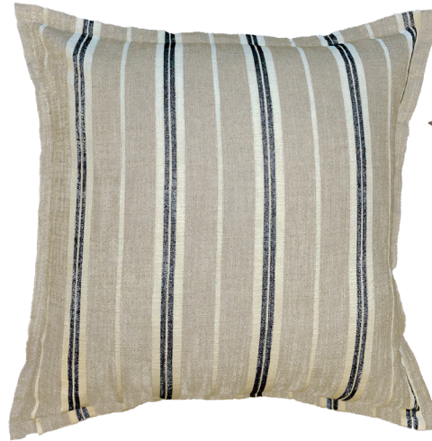
NATURAL/BLACK 50 X 50 CM