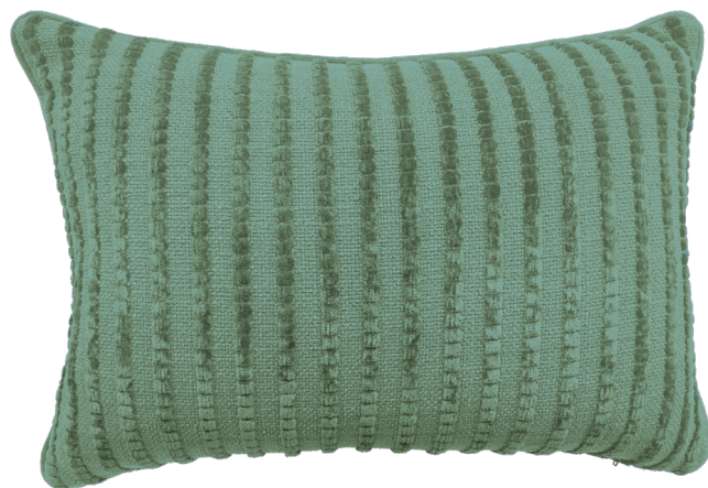
EUCALYPTUS 35 X 50 CM