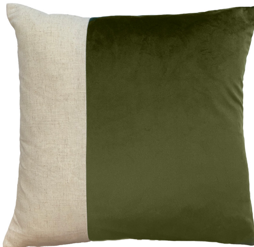
OLIVE 50 x 50 cm