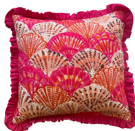
PINK 50 x 50 cm