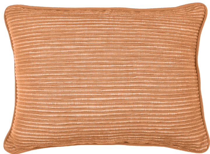
PECAN 35 X 50 CM