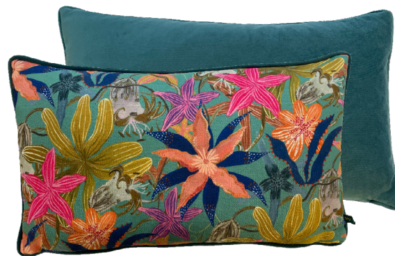
LUNA FLORAL MULTI 30 x 50 cm