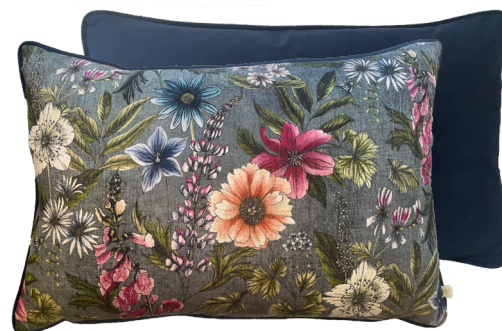
HIDCOTE MANOR ALMA PETROL 40 x 60 cm