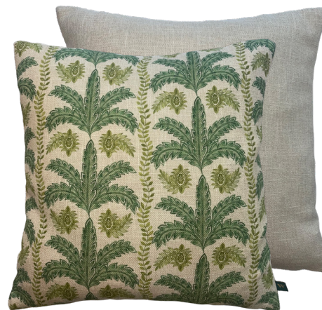
PATERA PALM 43 x 43 cm