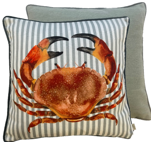
Crab 43 x 43 cm