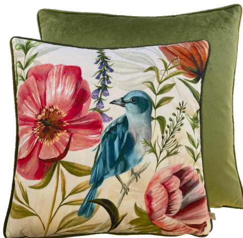
NECTAR GARDEN BLUEBIRD BLOOM 43 x 43 cm