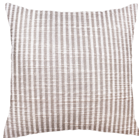
NATURAL 45 x 45 cm