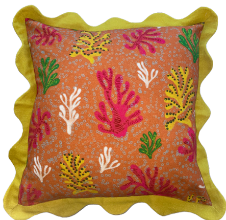
CITRONELLE 50 x 50 cm