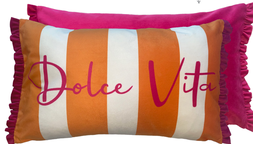
DOLCE VITA ORANGE/PINK 30 X 50 CM