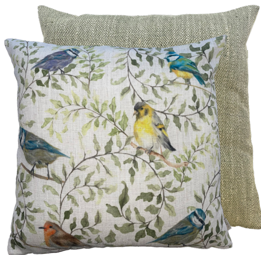
Birds 43 x 43 cm