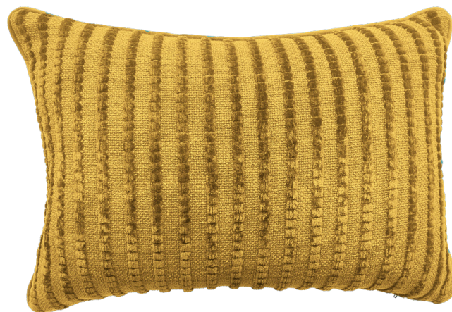
GOLD 35 x 50 cm