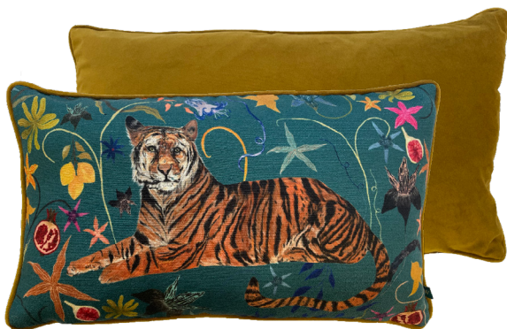
MADAGASCAN TIGER MULTI 30 x 50 cm