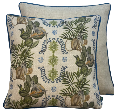
LAGOS MONKEY 43 x 43 cm