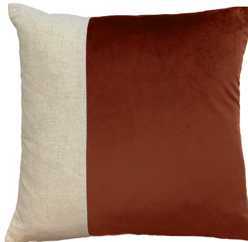
BRICK 50 x 50 cm