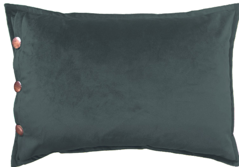
SLATE BLUE 35 x 50 cm