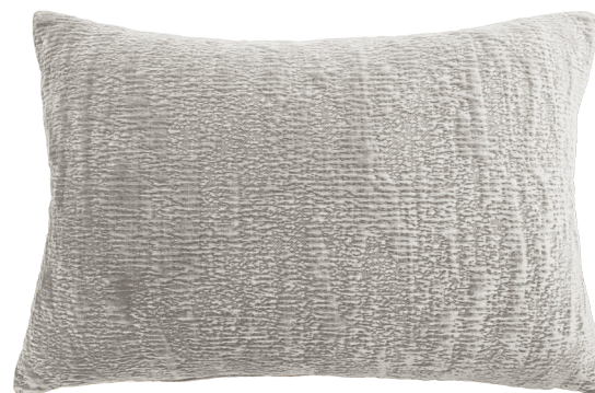
NATURAL 40 x 60 cm