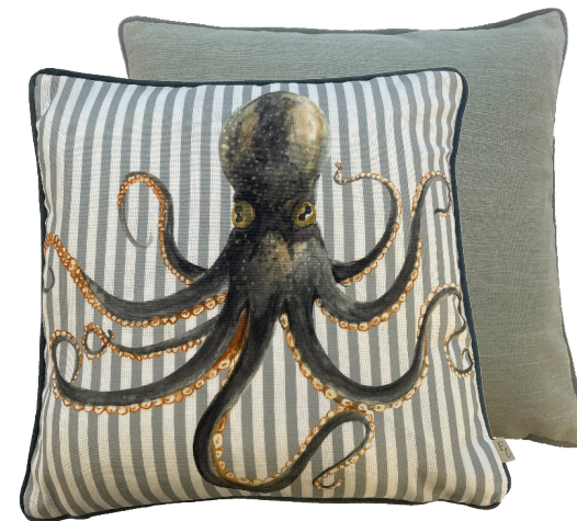
Octopus 43 x 43 cm