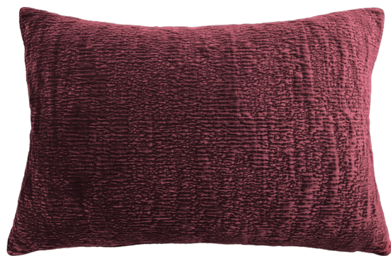
BURNT RED 40 x 60 cm