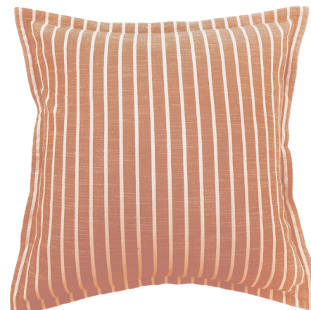
PECAN 45 x 45 cm