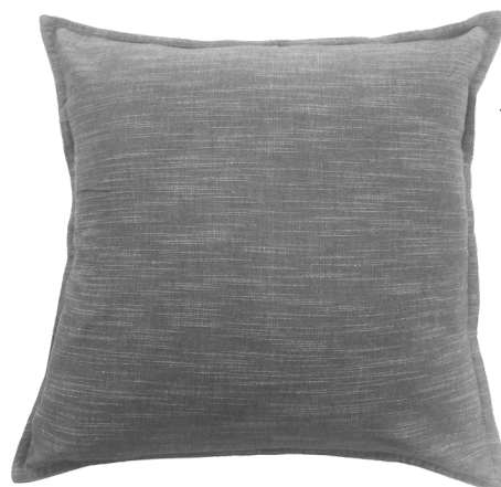
STONE 45 x 45 cm