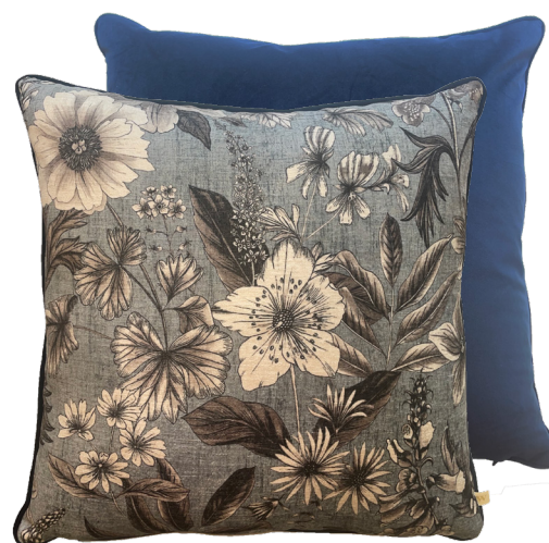
HARLINGTON BOTANY PETROL 50 x 50 cm