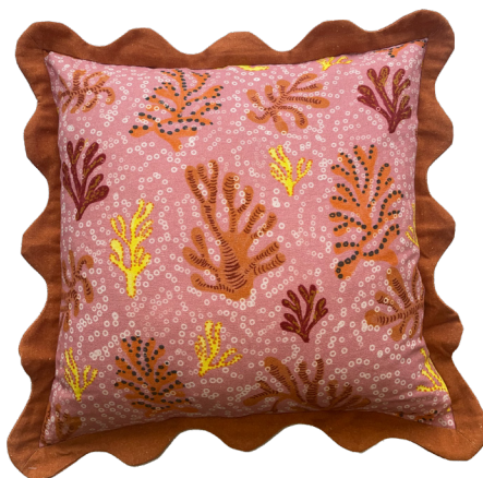
SANDY PINK 50 x 50 cm