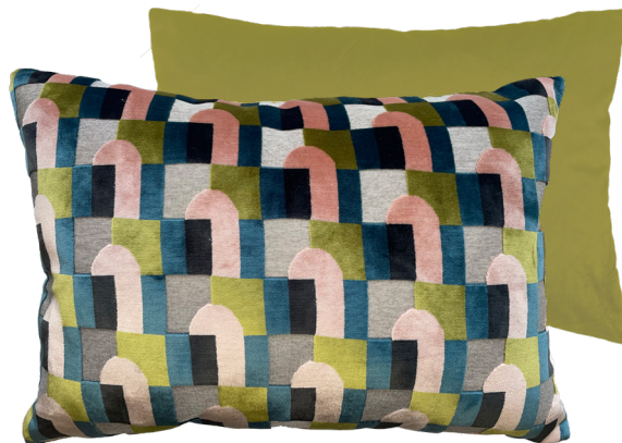
KEELA Pink/Avo 35 x 50 cm