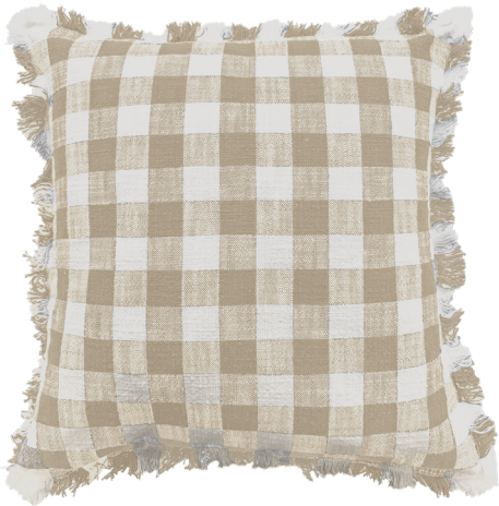
NATURAL 45 x 45 cm