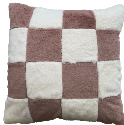
pink 50 x 50 cm