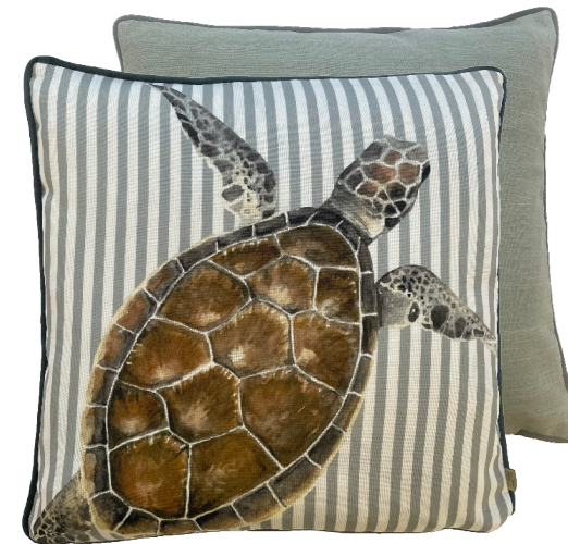
Turtle 43 x 43 cm