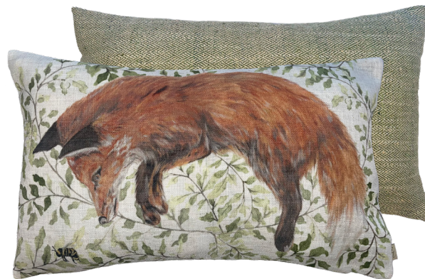
Leaping Fox 30 x 50 cm

The beauty of Shugborough, a rich blend of emerging foliage and wildlife. This collection was inspired by the scenery and rural surroundings of British countryside. Fresh soothing colours deep rooted in nature add forest flair to your interior and give an optimistic feel, ideal for an uplifting space and inviting the outdoors in. A timeless take on flora and fauna encapsulating rich tones of sage and vibrant hues of orange and neutral grounds keep you connected to nature, allowing the beauty of wildlife to shine through.