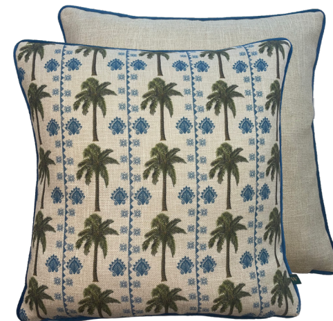
RODIS PALM 43 x 43 cm