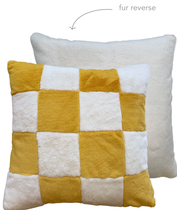
yellow 50 x 50 cm