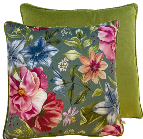
NECTAR GARDEN PETUNIA TEAL 43 x 43 cm