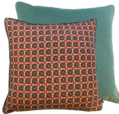
ONIKA BLUE 43 x 43 cm