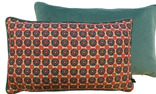
ONIKA BLUE 30 X 50 CM