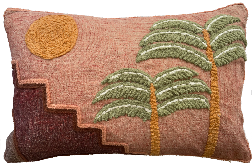
MOLOKO PINK SUNSET 40 X 60 CM