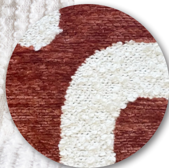
bouclé jaquard detail