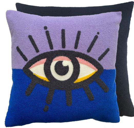
lilac/blue 45 x 45 cm