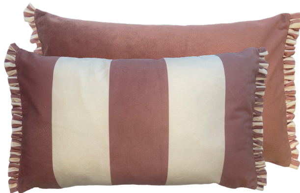
PINK 30 X 50 CM