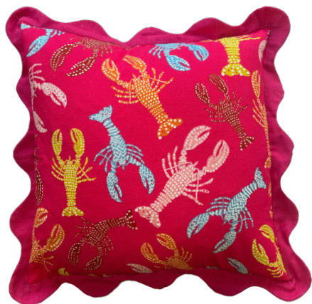
PINK 50 x 50 cm