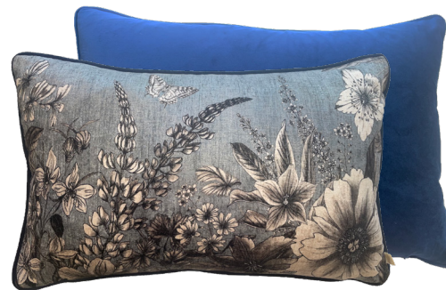
HARLINGTON BOTANY PETROL 30 x 50 cm