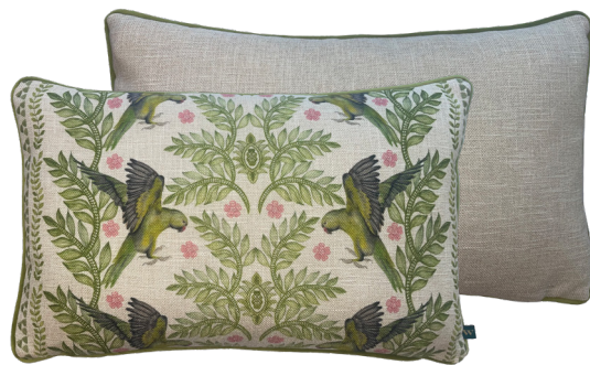
PEDRA PARROTS 30 x 50 cm