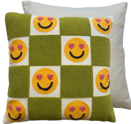
green 50 x 50 cm