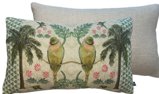
ZIKA PARROTS 30 x 50 cm