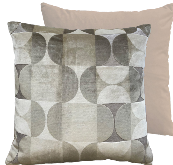
BARDOT Natural 50 x 50 cm