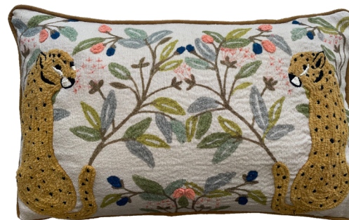
MIRRORED CHEETAH MULTI 30 x 50 cm