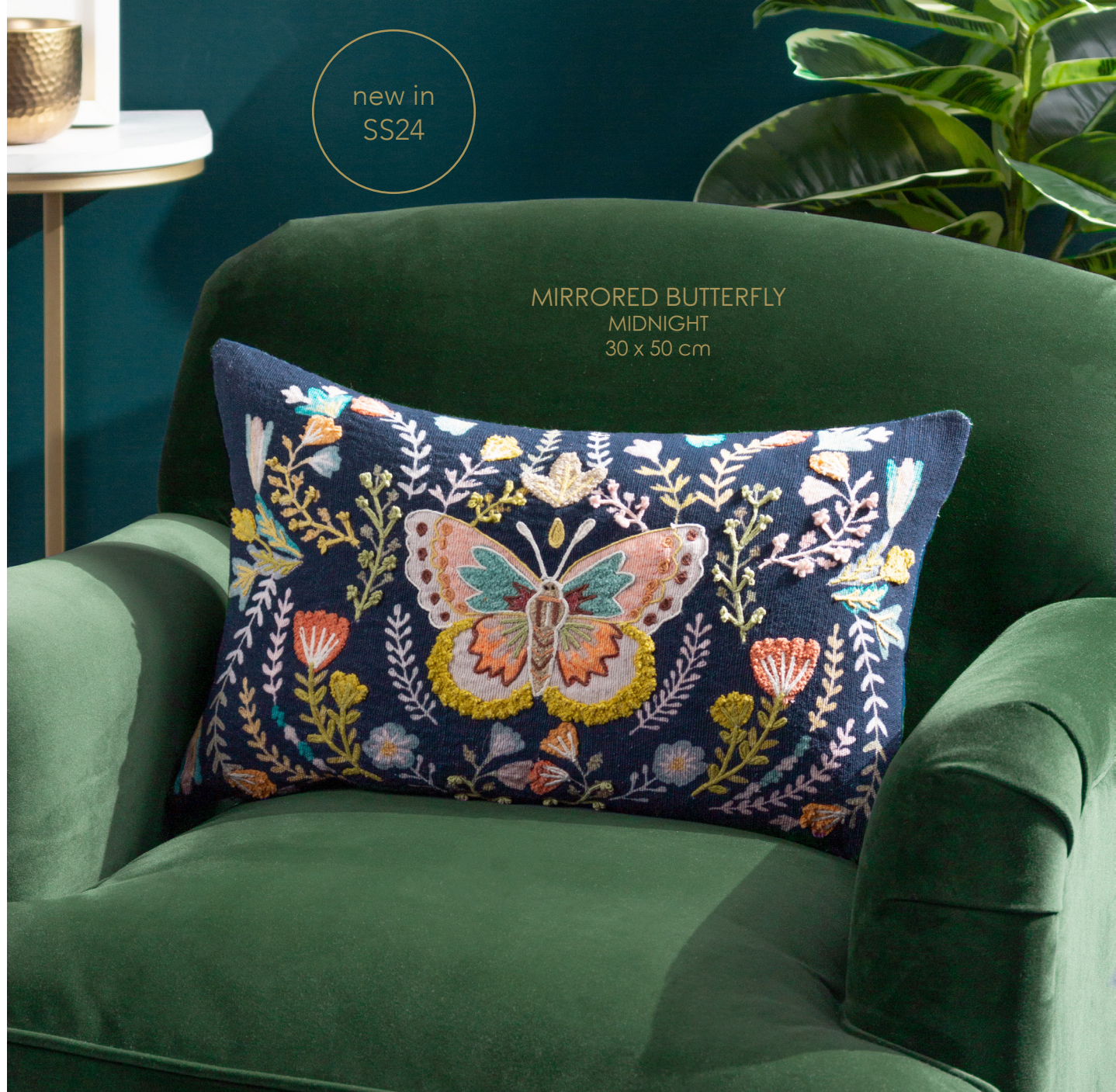
MIRRORED BUTTERFLY MIDNIGHT 30 x 50 cm