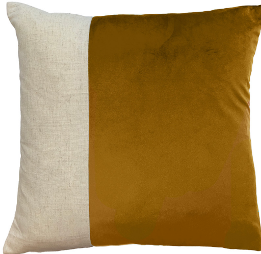
GOLD 50 x 50 cm