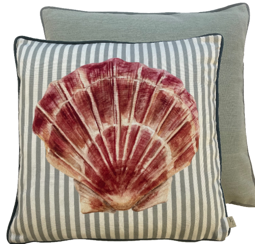
Scallop 43 x 43 cm