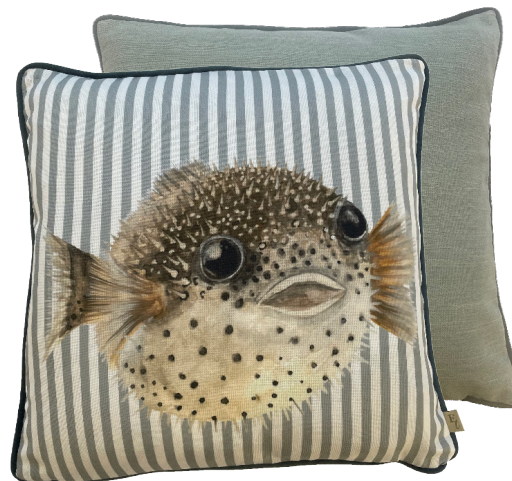
Puffer Fish 43 x 43 cm