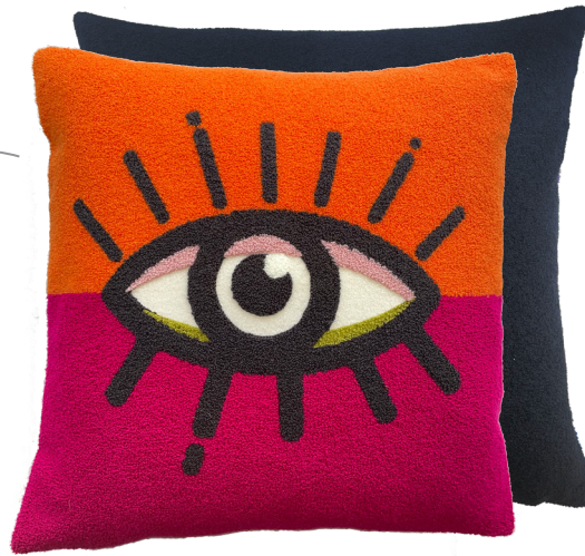
orange/pink 45 x 45 cm