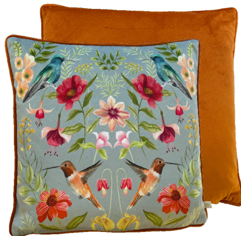
NECTAR GARDEN BLOSSOM MULTI 43 x 43 cm