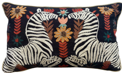
MIRRORED ZEBRA MULTI 30 x 50 cm