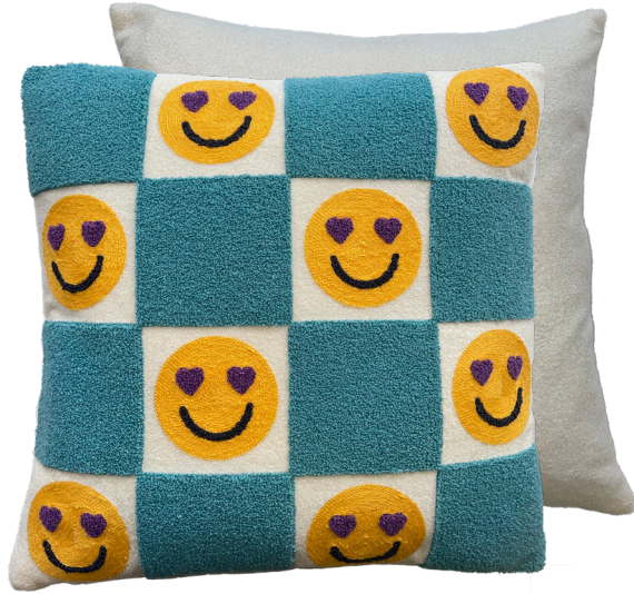
sky blue 50 x 50 cm