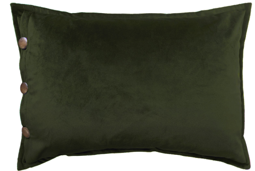
FOREST 35 x 50 cm