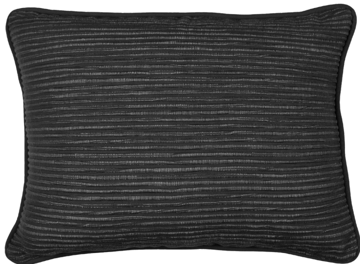
BLACK 35 X 50 CM