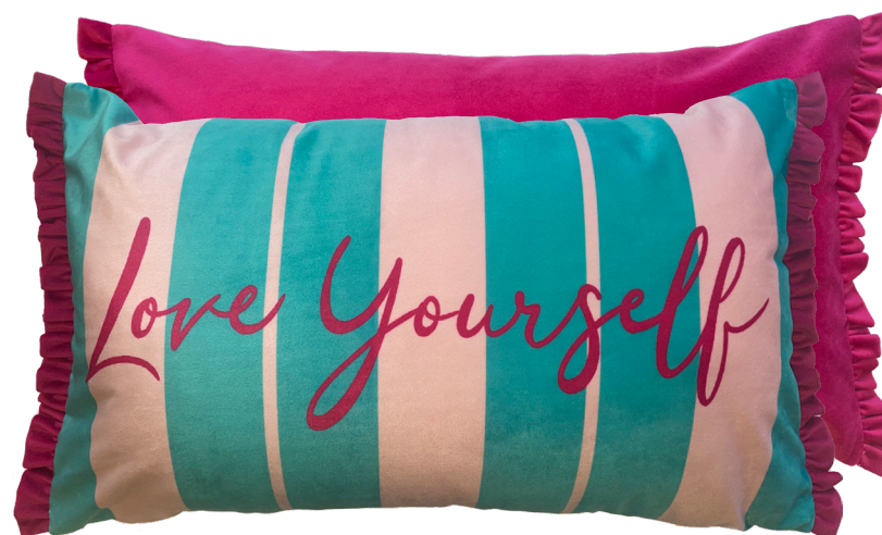
LOVE YOURSELF AQUA/PINK 30 X 50 CM