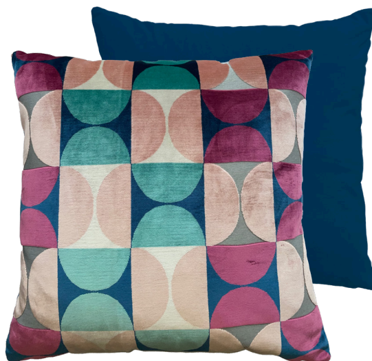
BARDOT Magenta/Blue 50 x 50 cm