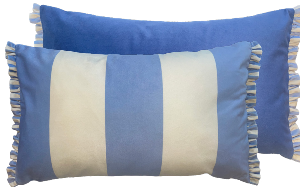
BLUE 30 X 50 CM