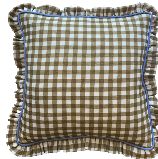
GOLD 45 x 45 cm