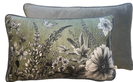
HARLINGTON BOTANY MOSS 30 x 50 cm