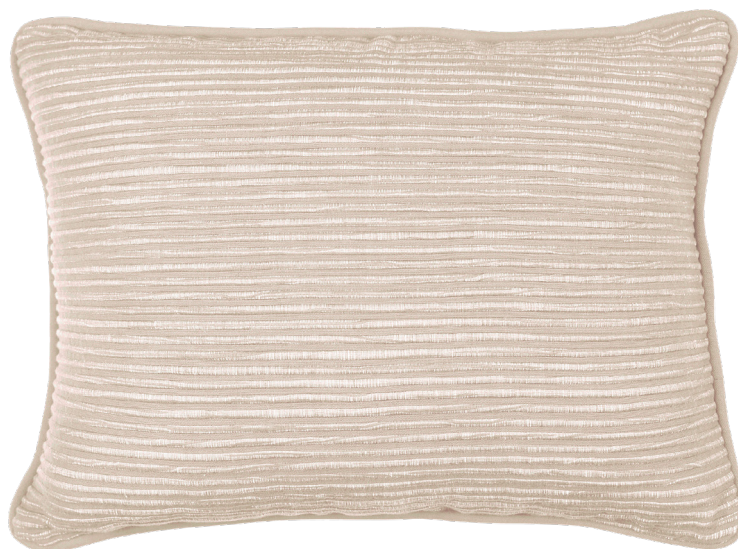
NATURAL 35 X 50 CM