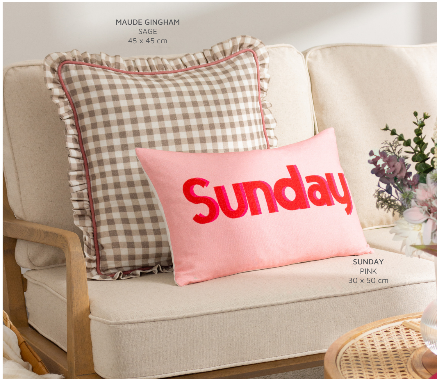
SUNDAY PINK 30 x 50 cm