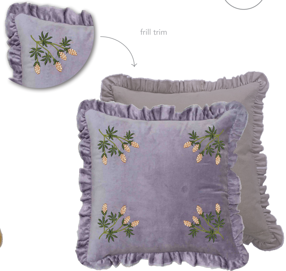
HETTIE | Cotton velvet