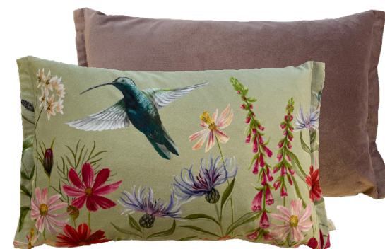
NECTAR GARDEN HUMMINGBIRD MULTI 30 x 50 cm