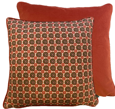
ONIKA GREEN 43 x 43 cm