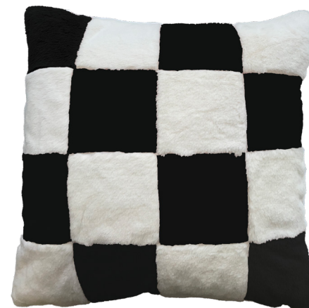
black 50 x 50 cm