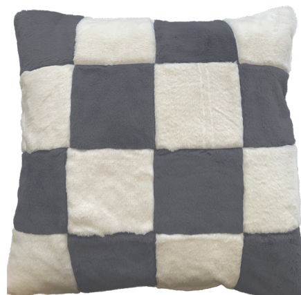
slate blue 50 x 50 cm