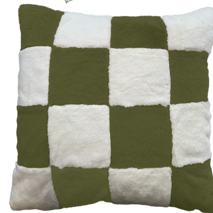
olive 50 x 50 cm