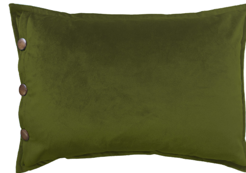
OLIVE 35 x 50 cm