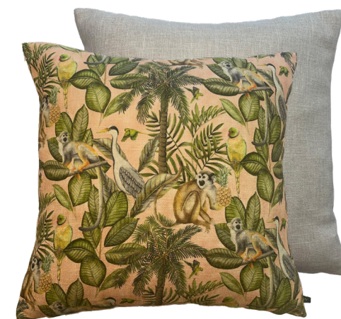
TOMAI JUNGLE 43 x 43 cm