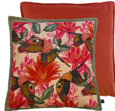
INIKO PARROTS Multi 43 x 43 cm