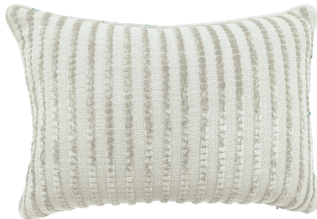
MILK 35 x 50 cm