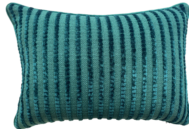
TEAL 35 x 50 cm