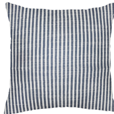
SKYLINE 45 x 45 cm