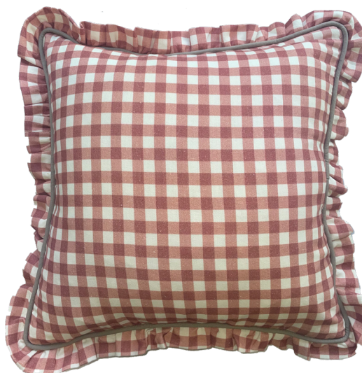
ROSE 45 x 45 cm