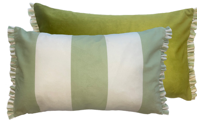
GREEN 30 X 50 CM