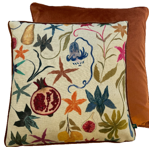
POMONA FLORAL 43 x 43 cm