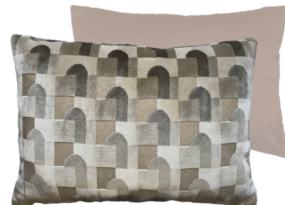
KEELA Natural 35 x 50 cm