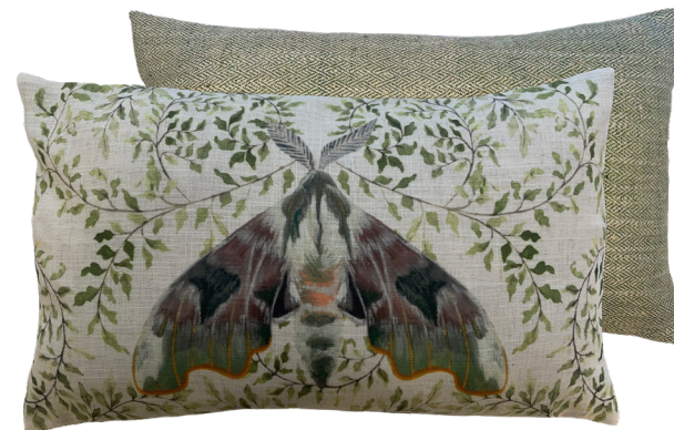
Moth 30 x 50 cm