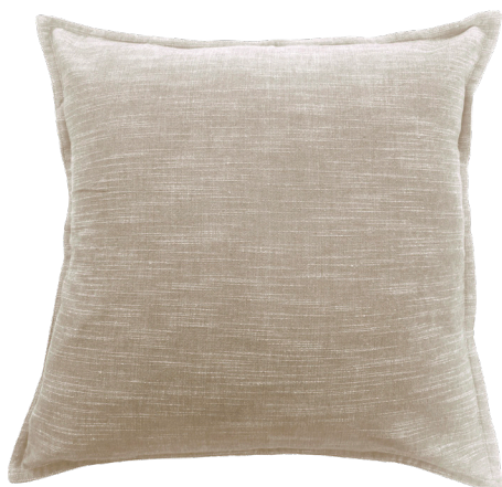
NATURAL 45 x 45 cm