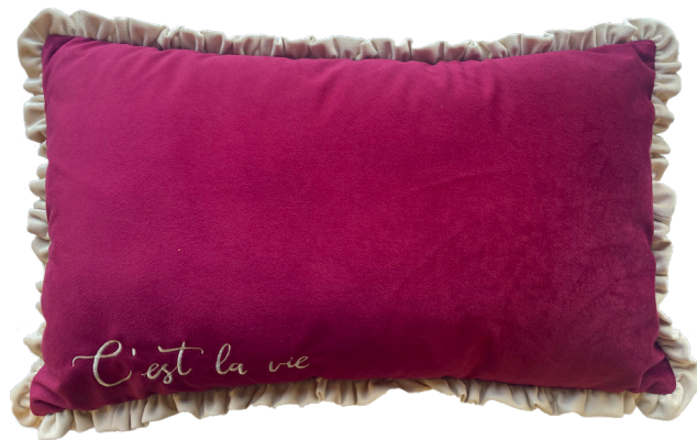
BERRY 30 X 50 CM