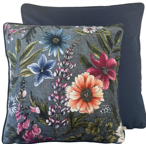
HIDCOTE MANOR ALMA PETROL 50 x 50 cm