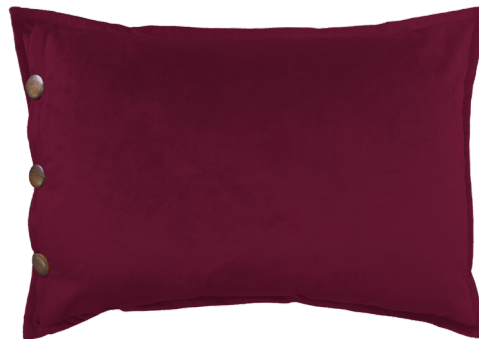
CHERRY 35 x 50 cm