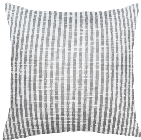
GREY 45 x 45 cm