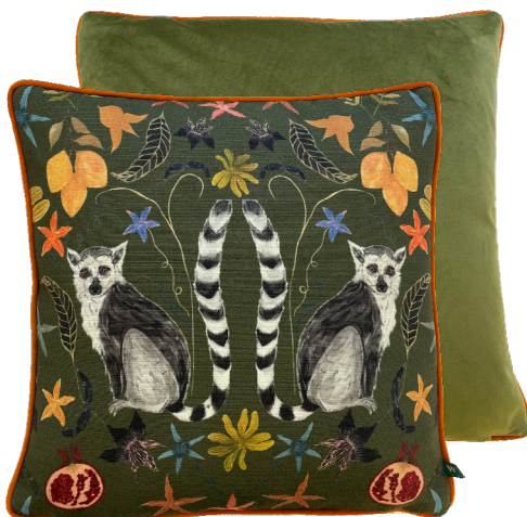
LEMURS EMERALD 43 x 43 cm