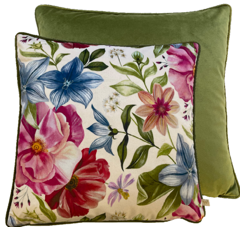
NECTAR GARDEN PETUNIA CREAM 43 x 43 cm