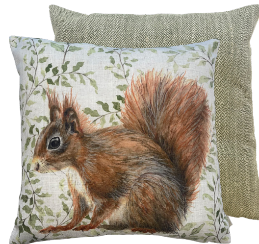
Squirrel 43 x 43 cm