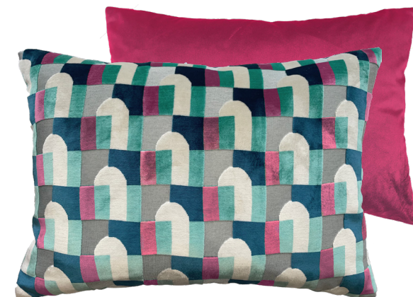
KEELA Magenta/Blue 35 x 50 cm