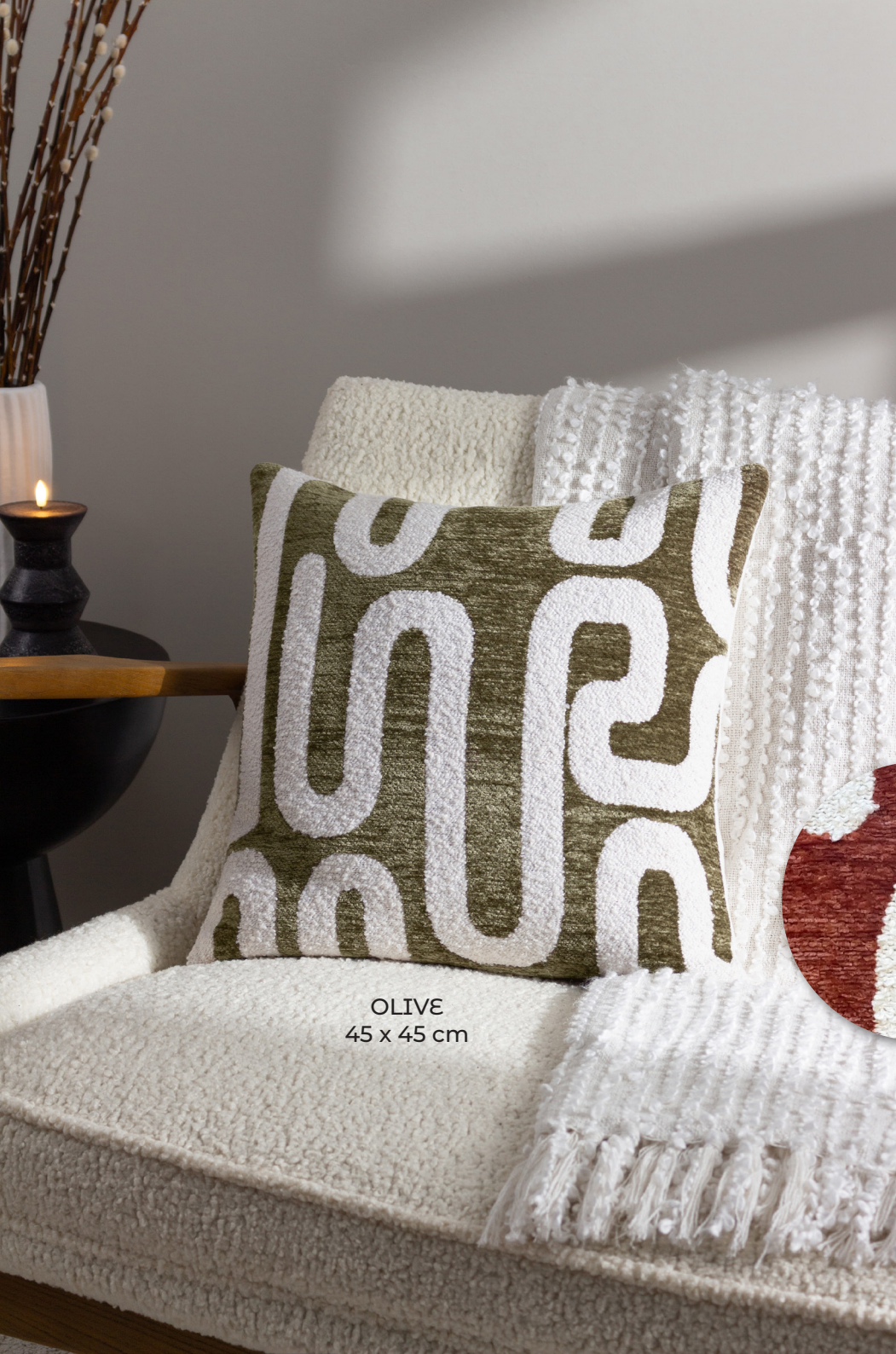
OLIVE 45 x 45 cm