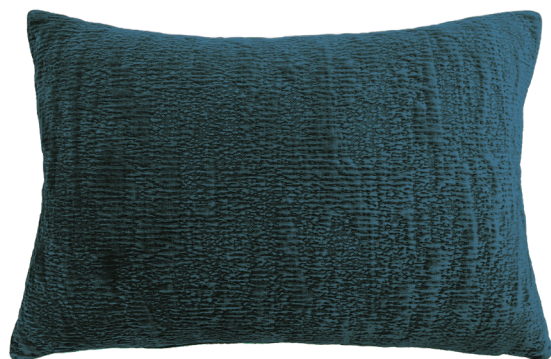
PETROL 40 x 60 cm