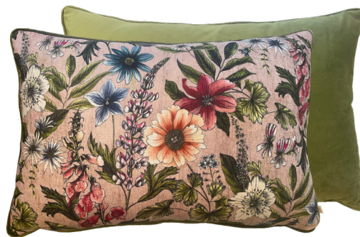
HIDCOTE MANOR ALMA BLUSH 40 x 60 cm