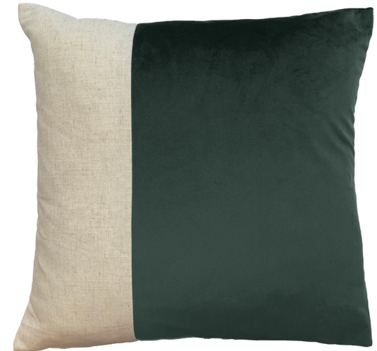
SLATE BLUE 50 x 50 cm