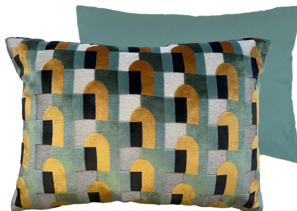
KEELA GOLD/BLUE 35 x 50 cm