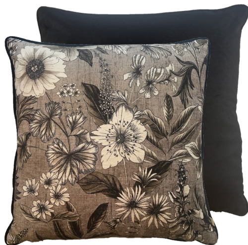
HARLINGTON BOTANY SEPIA 50 x 50 cm