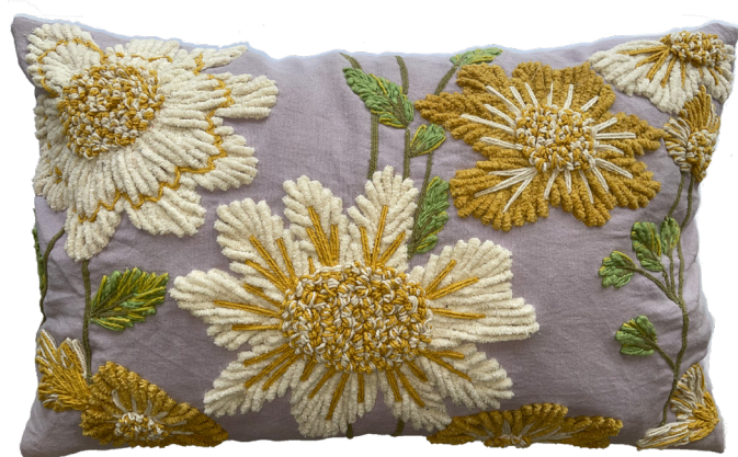
CHRYSANTHA LILAC 30 x 50 cm