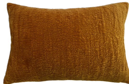
SAFFRON 40 x 60 cm