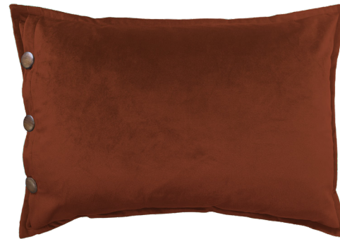
BRICK 35 x 50 cm