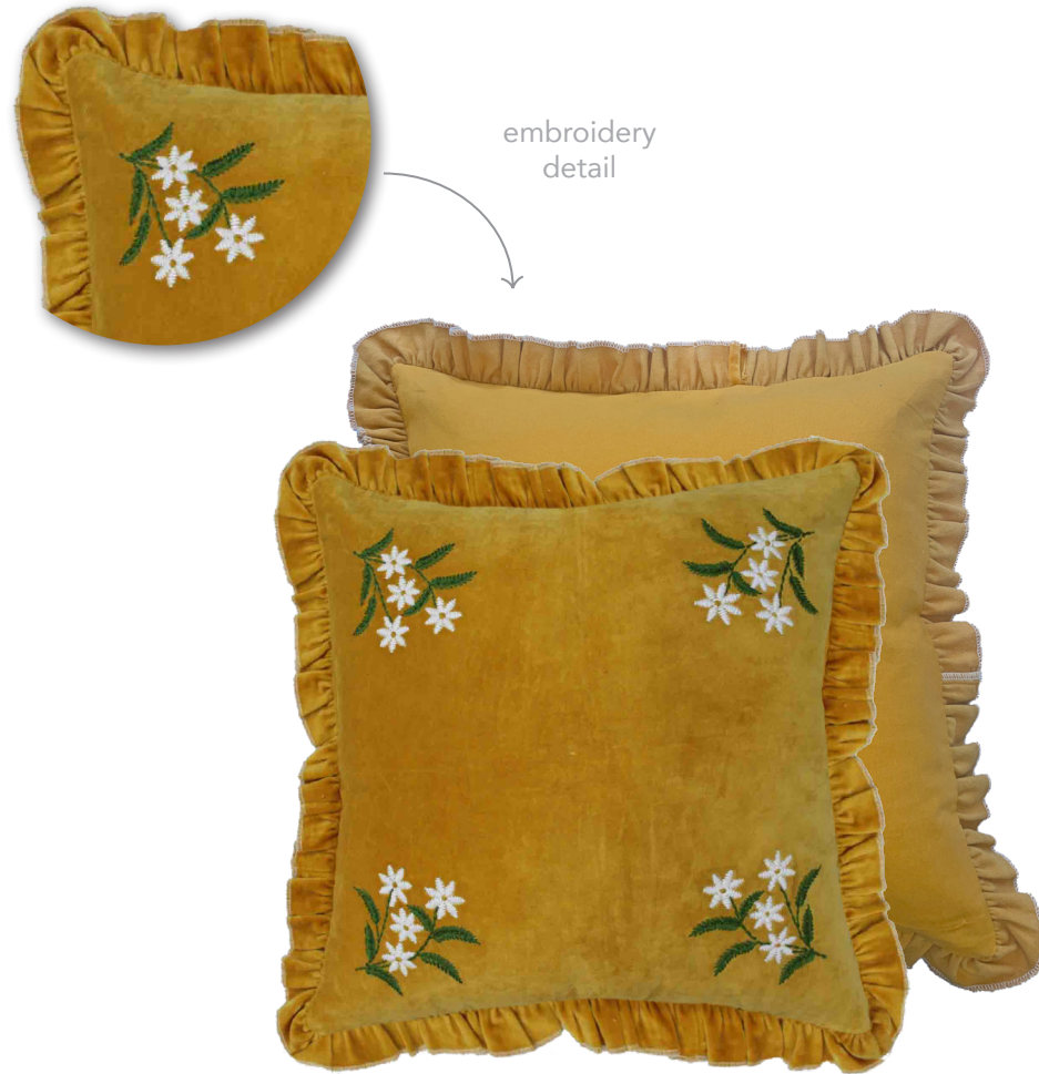
DAISY FRILL | Cotton velvet