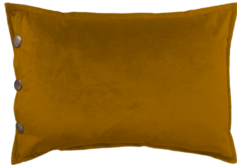
GOLD 35 x 50 cm