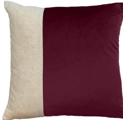
CHERRY 50 x 50 cm