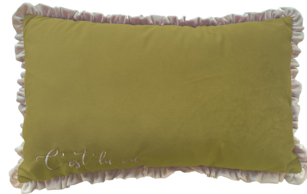
GREEN 30 X 50 CM