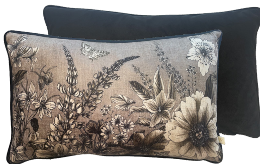
HARLINGTON BOTANY SEPIA 30 x 50 cm