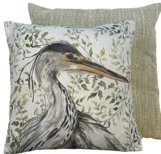
Heron 43 x 43 cm