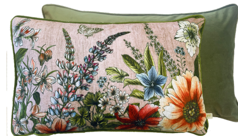
HIDCOTE MANOR ALMA BLUSH 30 x 50 cm