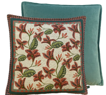
ZALA FLORAL 43 x 43 cm