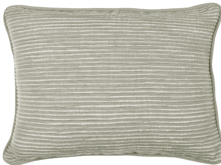
GREEN 35 X 50 CM