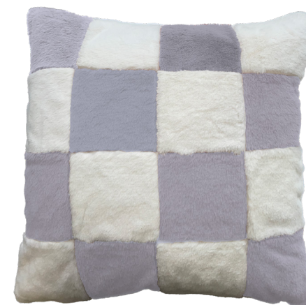
lilac 50 x 50 cm