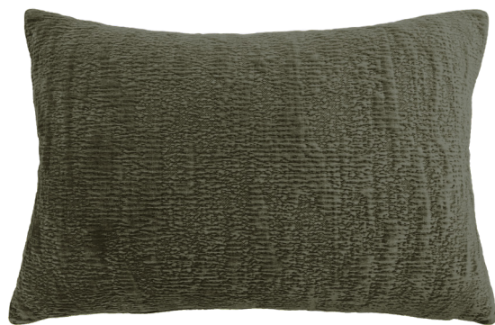
KHAKI 40 x 60 cm