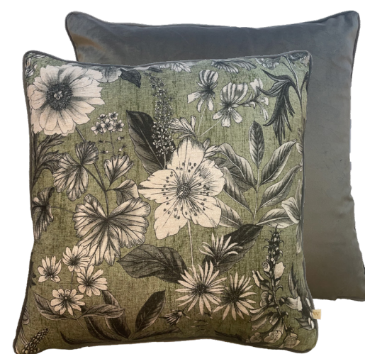
HARLINGTON BOTANY MOSS 50 x 50 cm