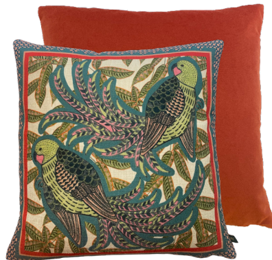
KARASI PARROTS Multi 43 x 43 cm