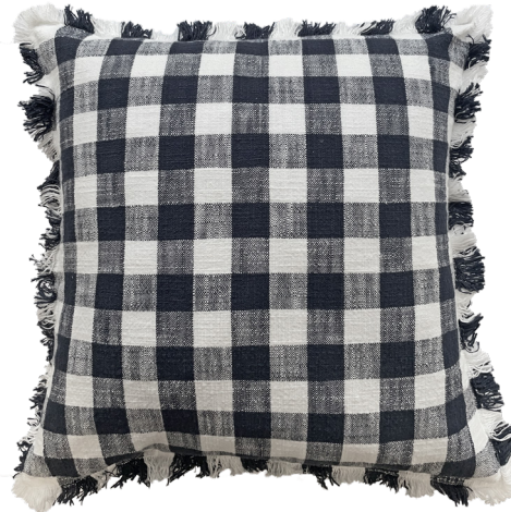
BLACK 45 x 45 cm