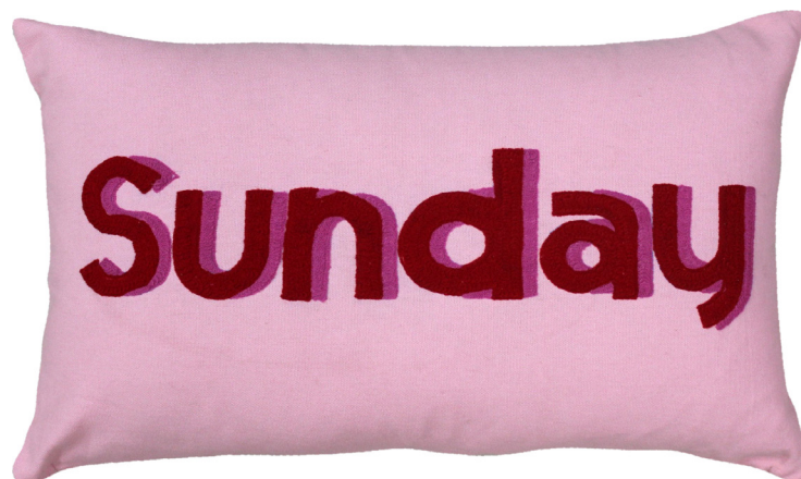
SUNDAY PINK 30 X 50 CM