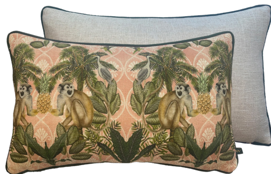
KOBRA MONKEYS 30 x 50 cm