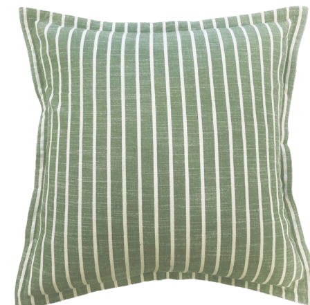
EUCALYPTUS 45 x 45 cm