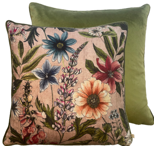
HIDCOTE MANOR ALMA BLUSH 50 x 50 cm