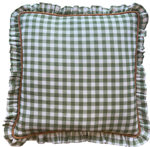
NATURAL 45 x 45 cm