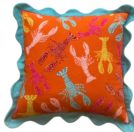
ORANGEADE 50 x 50 cm