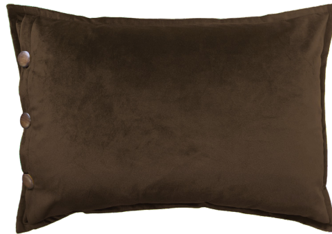
BROWN 35 x 50 cm