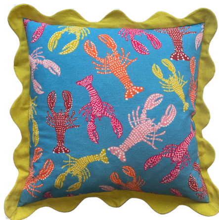
AQUA 50 x 50 cm