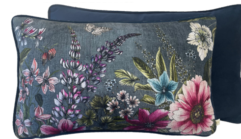
HIDCOTE MANOR ALMA PETROL 30 x 50 cm