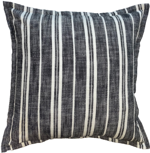
BLACK 50 X 50 CM