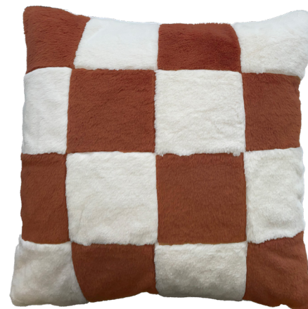
rusty 50 x 50 cm