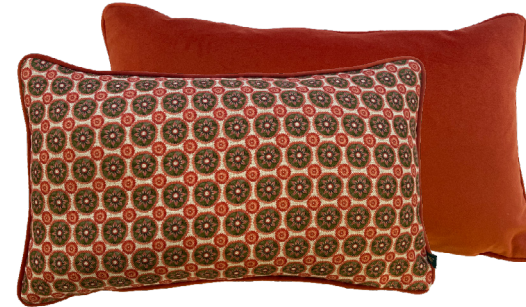
ONIKA GREEN 30 X 50 CM