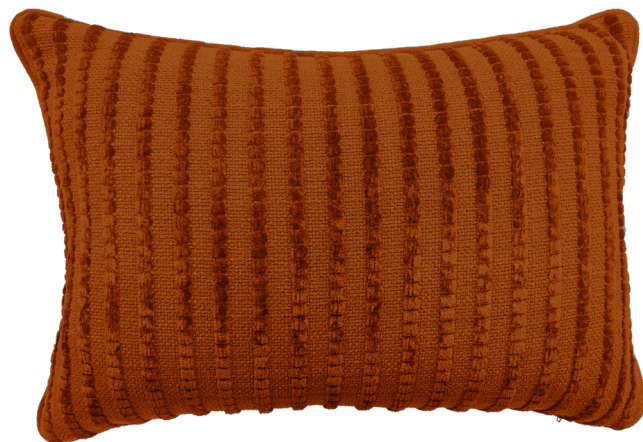
BRICK 35 x 50 cm