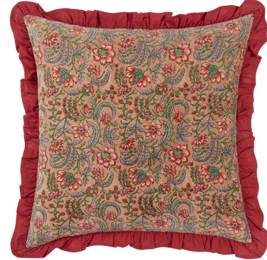
Haven - Blushing Rose