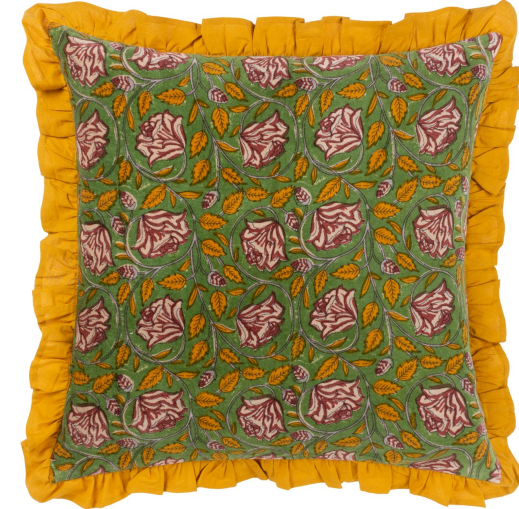
Howsdén - Verde