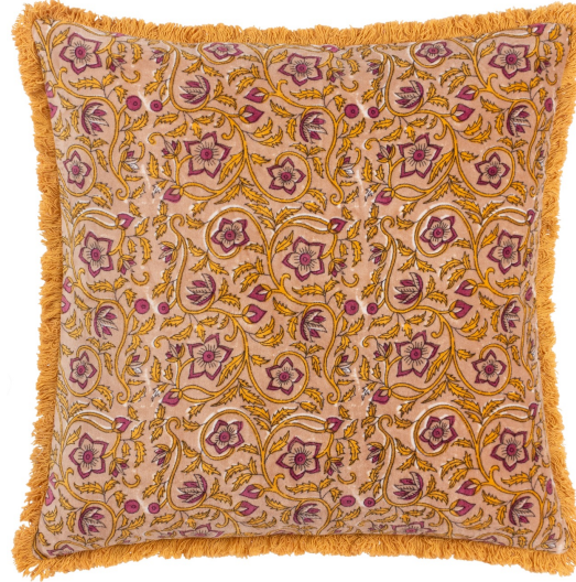
Filagree - Shell