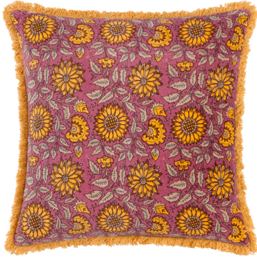
Clarendon - Plum