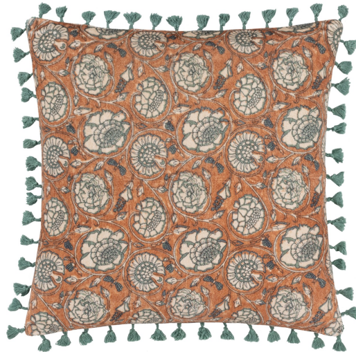
Salisa - Rust