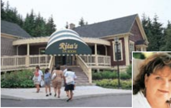
Just drop in for a cuppa, dear . . .

The Bras d'Or Lakes are a traditional home of Nova Scotia's native Mi'kmaq, and the Mi'kmaq language and culture are still evident today in the four reserves along its shores: Waycobah, Eskasoni (the largest reserve in the province), Wagmatcook, and Chapel Island in St. Peter's Inlet. Wagmatcook First Nation has a Mi'kmaq cultural and heritage centre, with a museum, exhibits, craft shop and restaurant (see p. 236).