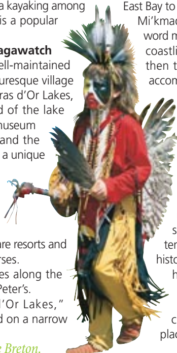
Pow wows keep traditions alive in Cape Breton.

Turn left back through Iona to MacCormack Provincial Picnic Park, which offers walking trails and a relaxing place to enjoy the beautiful surroundings. The road winds