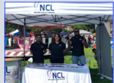
Summer Fete & Ramadan Souk 06.05.18