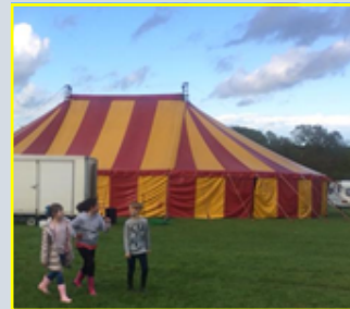
Harold Wood - Happy Circus 02.05.18