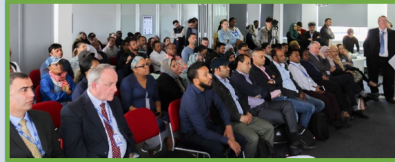
Employers Forum - 14.05.18