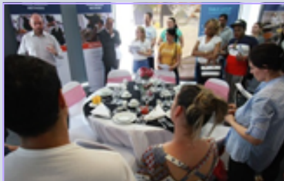
Conference & Banqueting Management Workshop/Exhibition 08.05.18