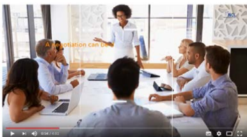
Pitching & Negotiation Skills 1 HND Business