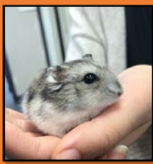
Russian Dwarf Hamster