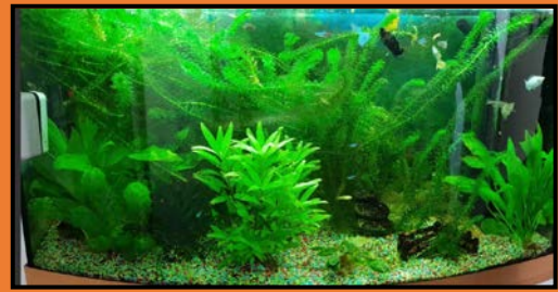
Tropical Fish Tank

Drop by and visit the NCL pets at the Ilford Campus!