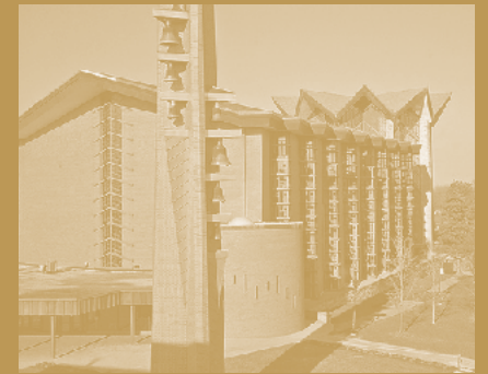
Valparaiso University Valparaiso, IN