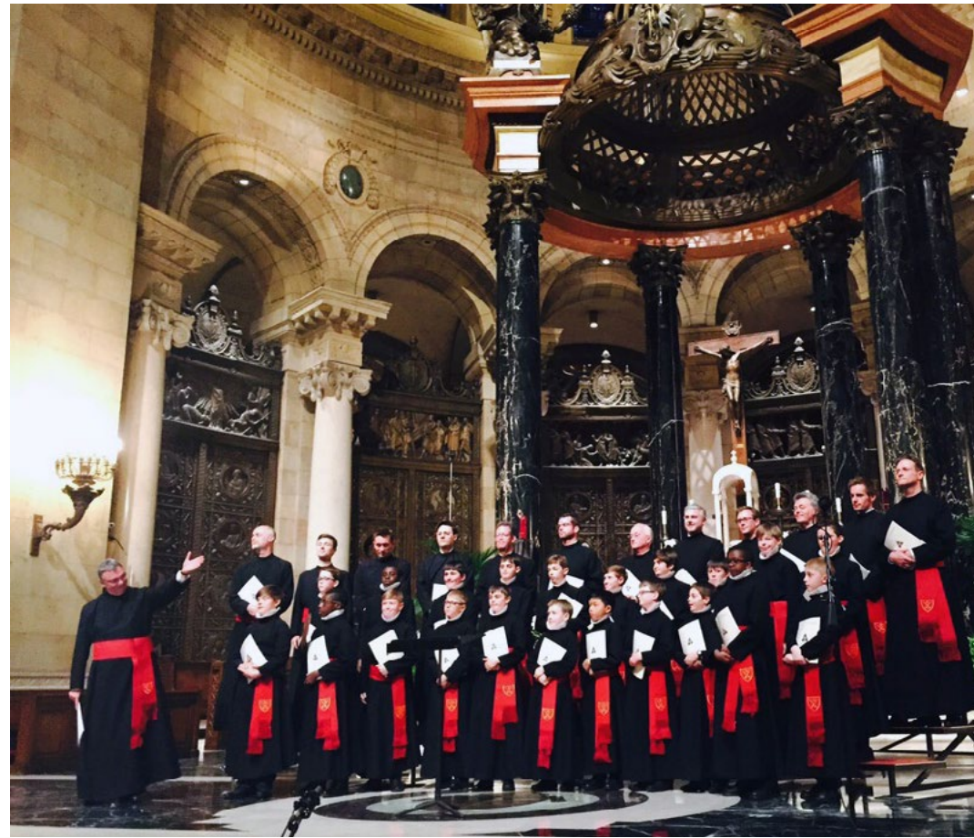
Soaking up the applause at the Cathedral of St Paul, Minnesota