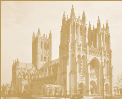
Washington National Cathedral Washington, DC