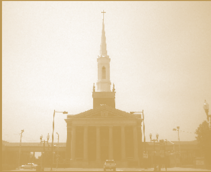
First United Methodist Church Shreveport, LA

In April 2015, St Paul's Cathedral Choir undertook a major concert tour of the USA, performing in eight cities across seven States. Audiences travelled great distances to hear the choir perform, and ticket sales exceeded predictions throughout the tour. Tens of thousands of people engaged with the tour campaign through our concerts and social media.