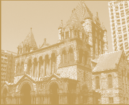
Trinity Church, Copley Square Boston, MA