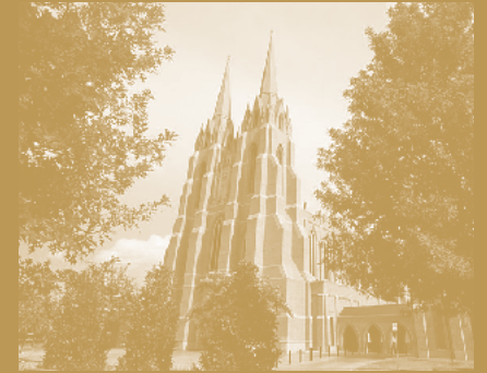
St Martin's Episcopal Church Houston, TX

In April 2015, St Paul's Cathedral Choir undertook a major concert tour of the USA, performing in eight cities across seven States. Audiences travelled great distances to hear the choir perform, and ticket sales exceeded predictions throughout the tour. Tens of thousands of people engaged with the tour campaign through our concerts and social media.