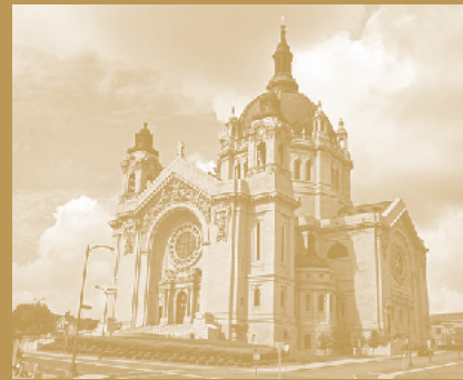
Cathedral of St Paul St Paul, MN