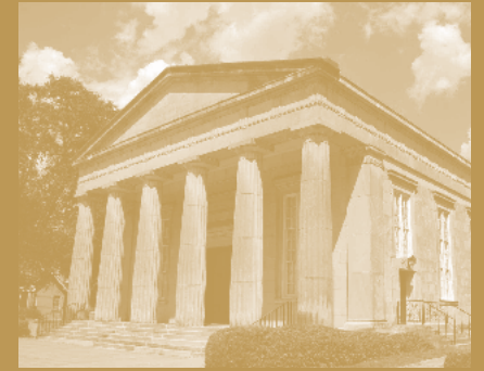
Vineville United Methodist Church Macon, GA