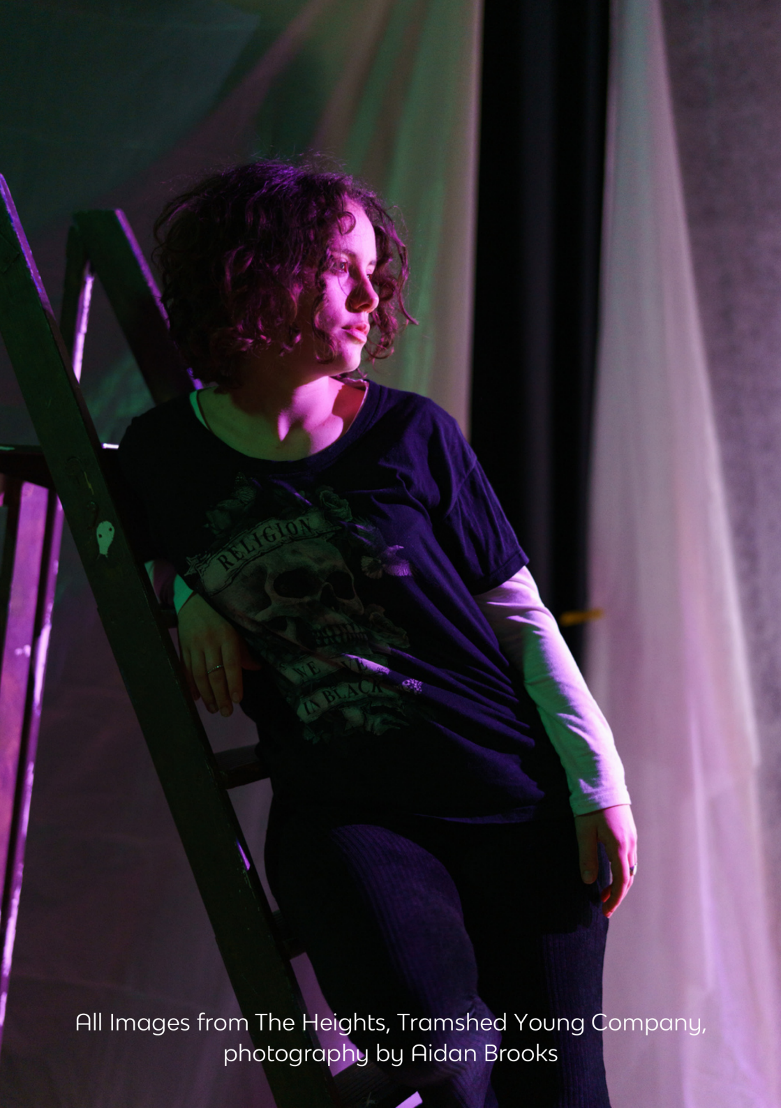
All Images from The Heights, Tramshed Young Company