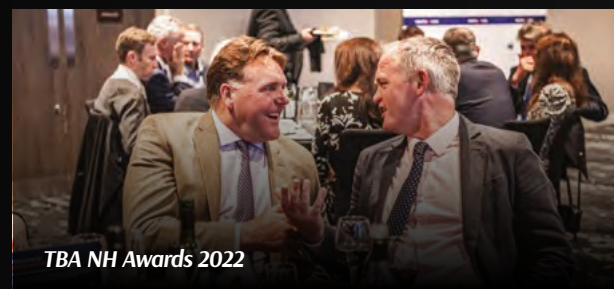
TBA NH Awards 2022