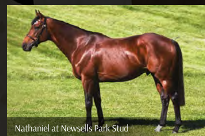
Nathaniel at Newsells Park Stud