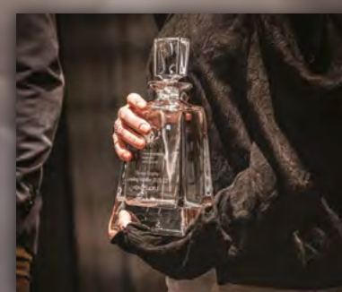
Honeysuckle gained two awards for connections on the evening - the Midnight Legend Trophy for Leading Hurdler Mare and the Yorton Trophy for Leading Hurdler