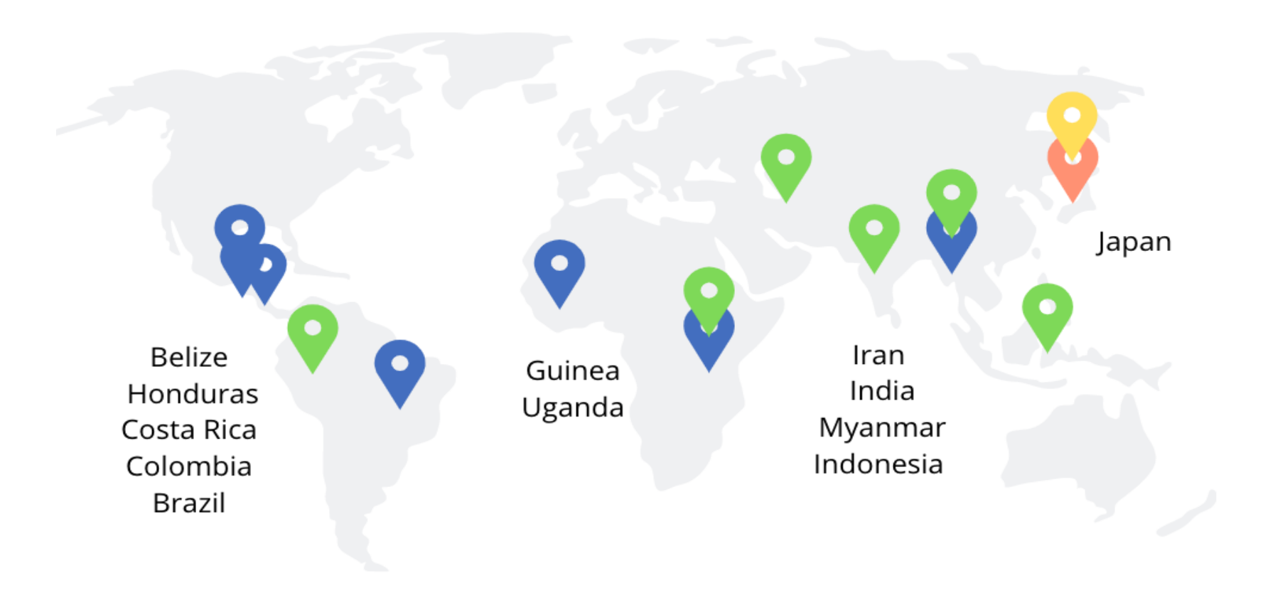
Map No. 1. Geographical distribution of case studies.