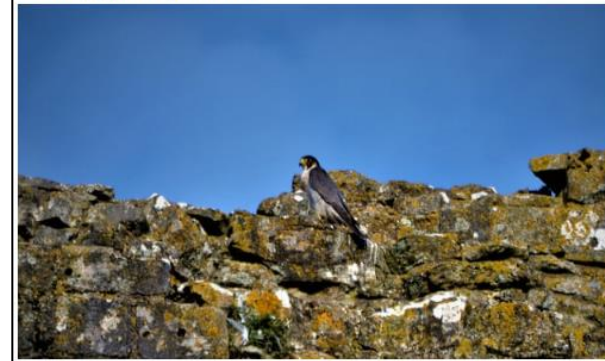
▲ A peregrine falcon at Corfe Castle, in Dorset.

Orca, cuckoo and peregrine falcon some of species enjoying breathing space of quieter world