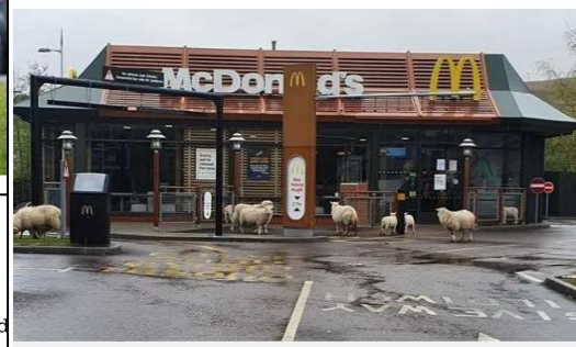
Everyone is missing McDonald's, even the sheep