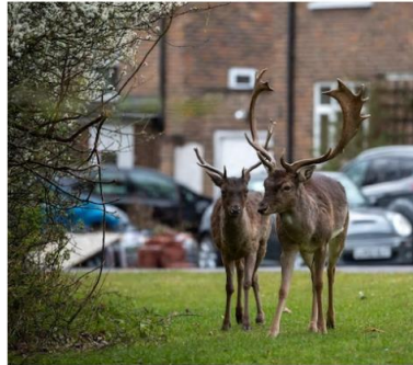
Deer in Harold Hill in Essex