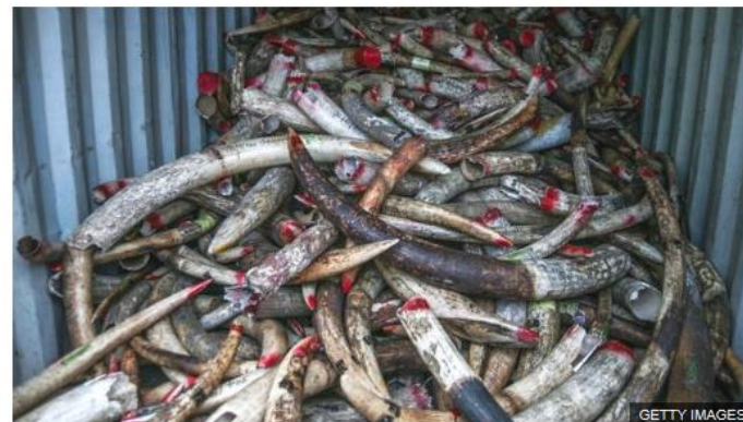
Seized ivory in Malaysia waiting to be destroyed