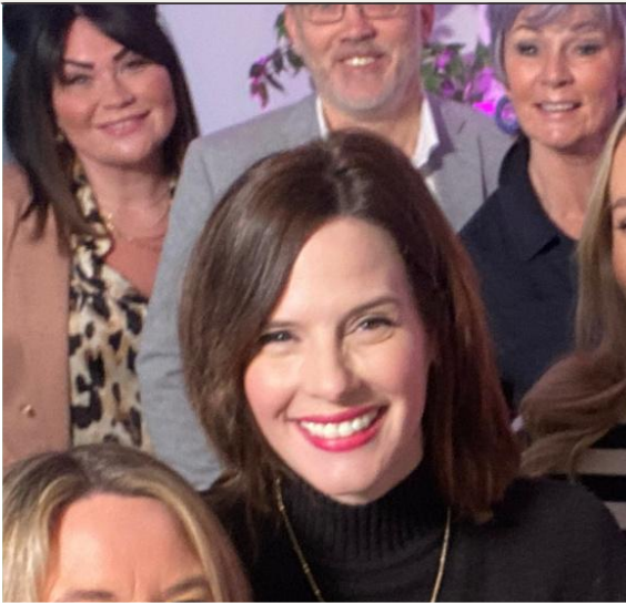
Talk to camera video