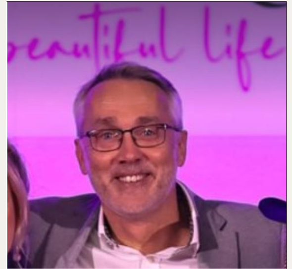
Day in the life reel