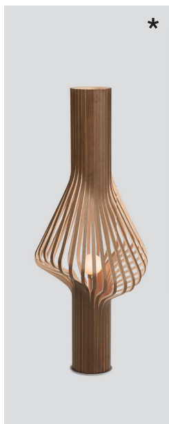
Diva floor smoked oak – Item no. 372