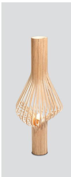
Diva floor oak – Item no. 370