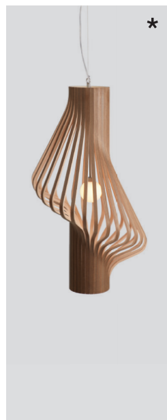
Diva pendant smoked oak – Item no. 382