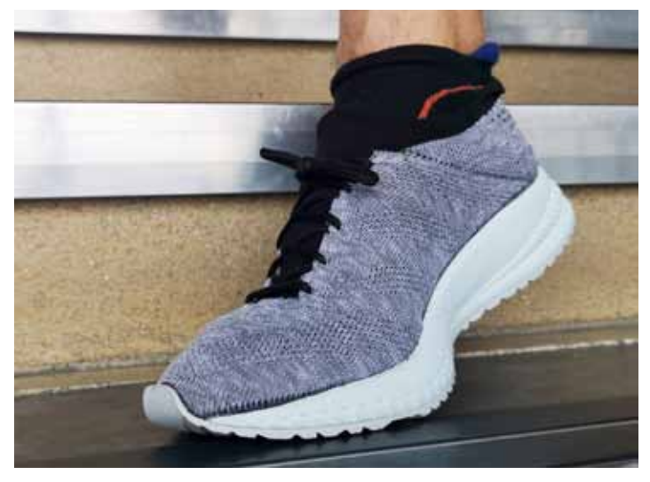
Footfalls & Heartbeats' Intelligent Shoe

Nottingham-based smart innovator - Footfalls & Heartbeats - is using its 'the textile is the sensor' technology to get our knitted shoes to talk to us. One such