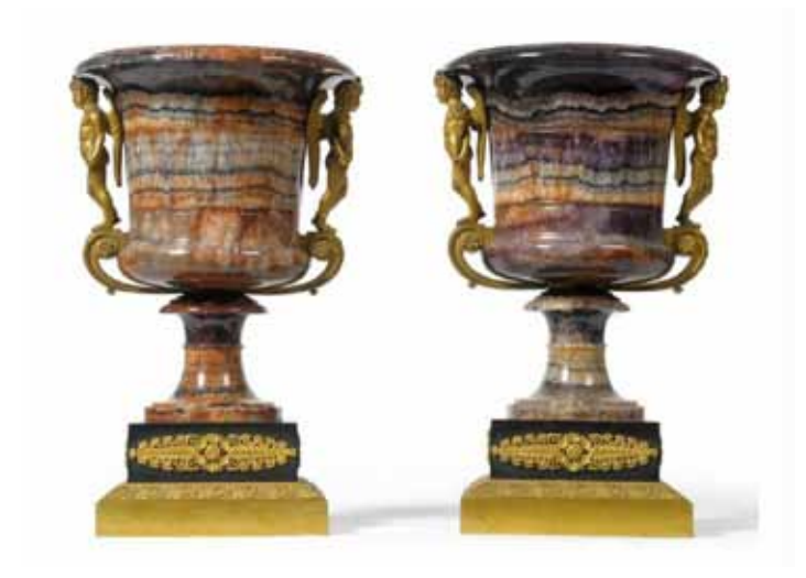
A Pair of Ormolu-Mounted Blue John Campana Shaped Pedestal Urns, 19th century, the mounts in the manner of Pierre-Philippe Thomire. Sold by Tennants for £120,000.

For early Brigantian risers, the 'Opening Lot' for the day will be the annual Brigantes Lecture which, unsurprisingly, will delve into the rarefied world of antiques, presented by leading experts.