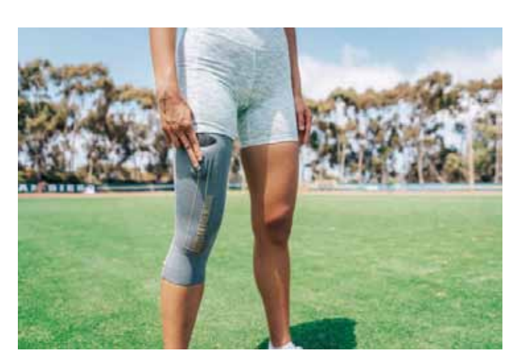
And the KiTT sleeve in action

Initially developed on a Santoni X intarsia knitting machine, F&H made the working prototype on a Stoll flatbed knitting machine. The key to this technology is a mathematically-based knitted structure that uses electrically-conductive yarns to form a repeatable and robust sensor network within the garment. This 3D complexity of the knitted structure – where the fibres in the yarn interact – allows subtle changes in the electrical resistance within the garment to be filtered, amplified and interpreted. F&H states 'this heralds the emergence of the next generation of smart textiles, where sensor functionality is integrated