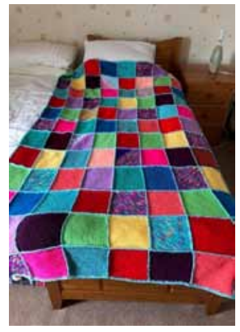
A selection of the knitted articles