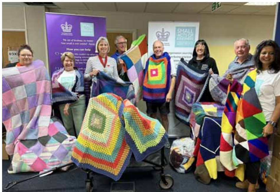
Small Acts of Kindness