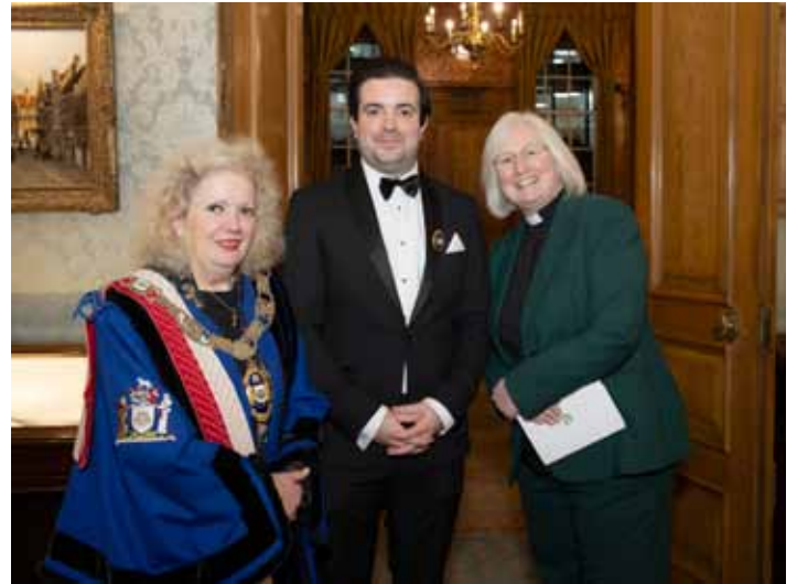
Master, Consort & Chaplain