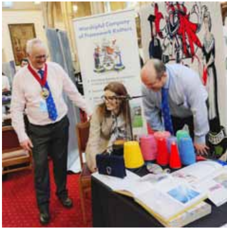
With the Lady Mayoress