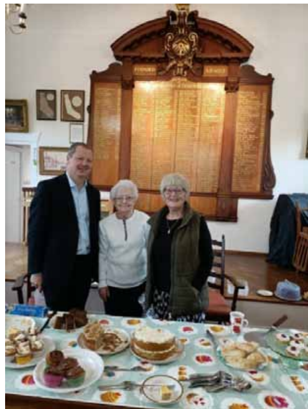
The Coffee Morning

On the coffee morning of 4th February, two benefits officers from Oadby & Wigston council joined us to discuss benefits and other topics. A number of Residents have since made personal appointments, which will prove worthwhile.