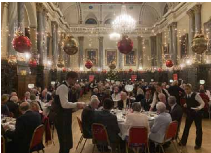
Reception and Supper