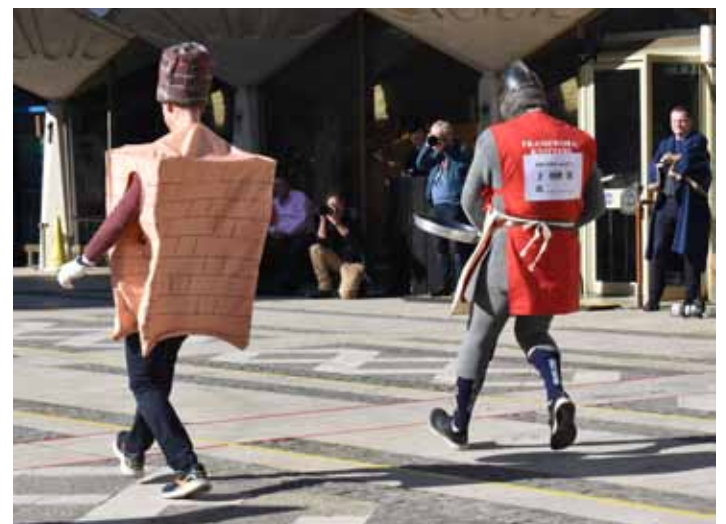
Sir Knit-A-Lot in full flow

While the race is all in good fun, it also serves a charitable purpose. Proceeds from the event support the Lord Mayor's Appeal, as well as