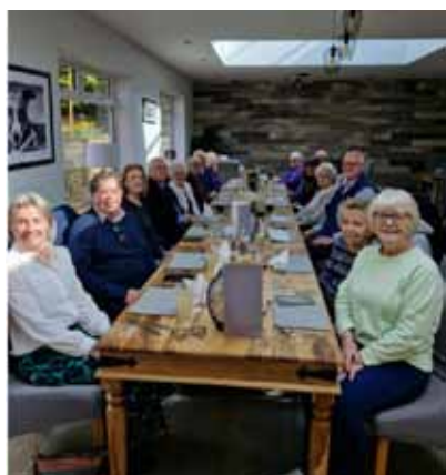
At The Crown Inn