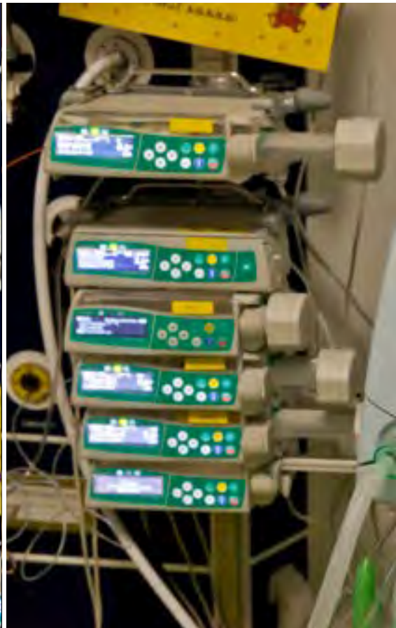
▲ Infusion pumps provide fluids, medicine or nutrients into the blood