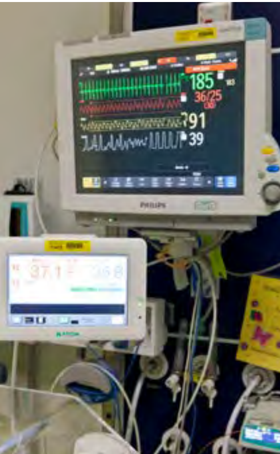
▲ Vital signs monitor (above) and temperature monitor (below)

These monitors check the amount of oxygen in your baby's blood, by shining a light through their skin. The sensors are strapped gently to your baby's foot or hand.