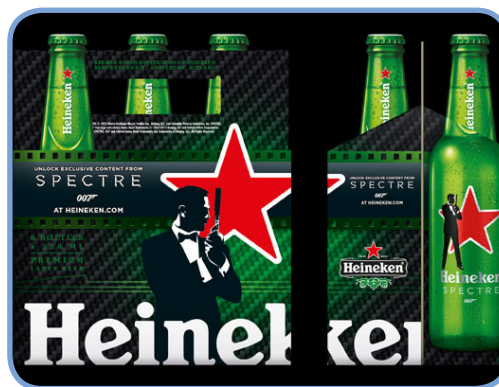
James Bond for Heineken