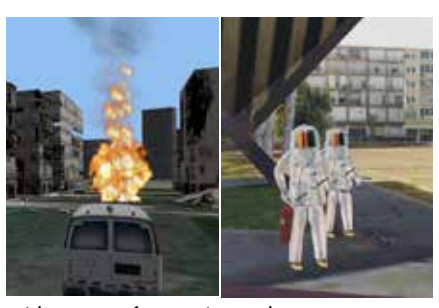
Wide range of scenarios and events