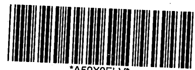
Chart Services Limited Annual report and Financial Statements For the year ended 31 March 2016 Company registration number: SC066722