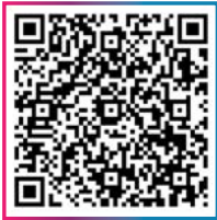
Feedback for Achieving Care Together week

Your feedback is important to us and helps us organise future events. We would appreciate it if you could fill out a short survey to submit your thoughts on the week by following this link or scanning the QR code below.