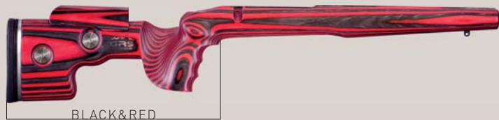
BLACK & RED