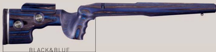
BLACK & BLUE