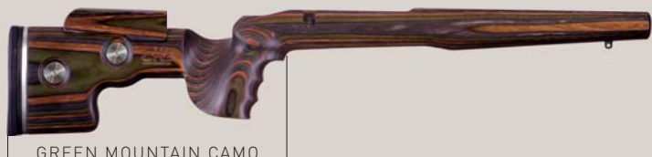
GREEN MOUNTAIN CAMO