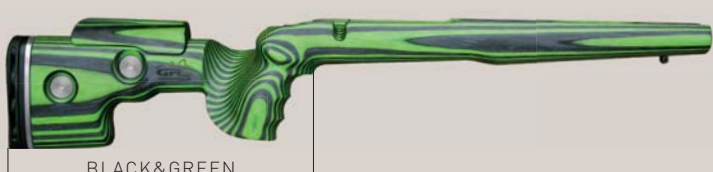
BLACK & GREEN

Colour nuances will vary. Shown here: GRS Sporter.