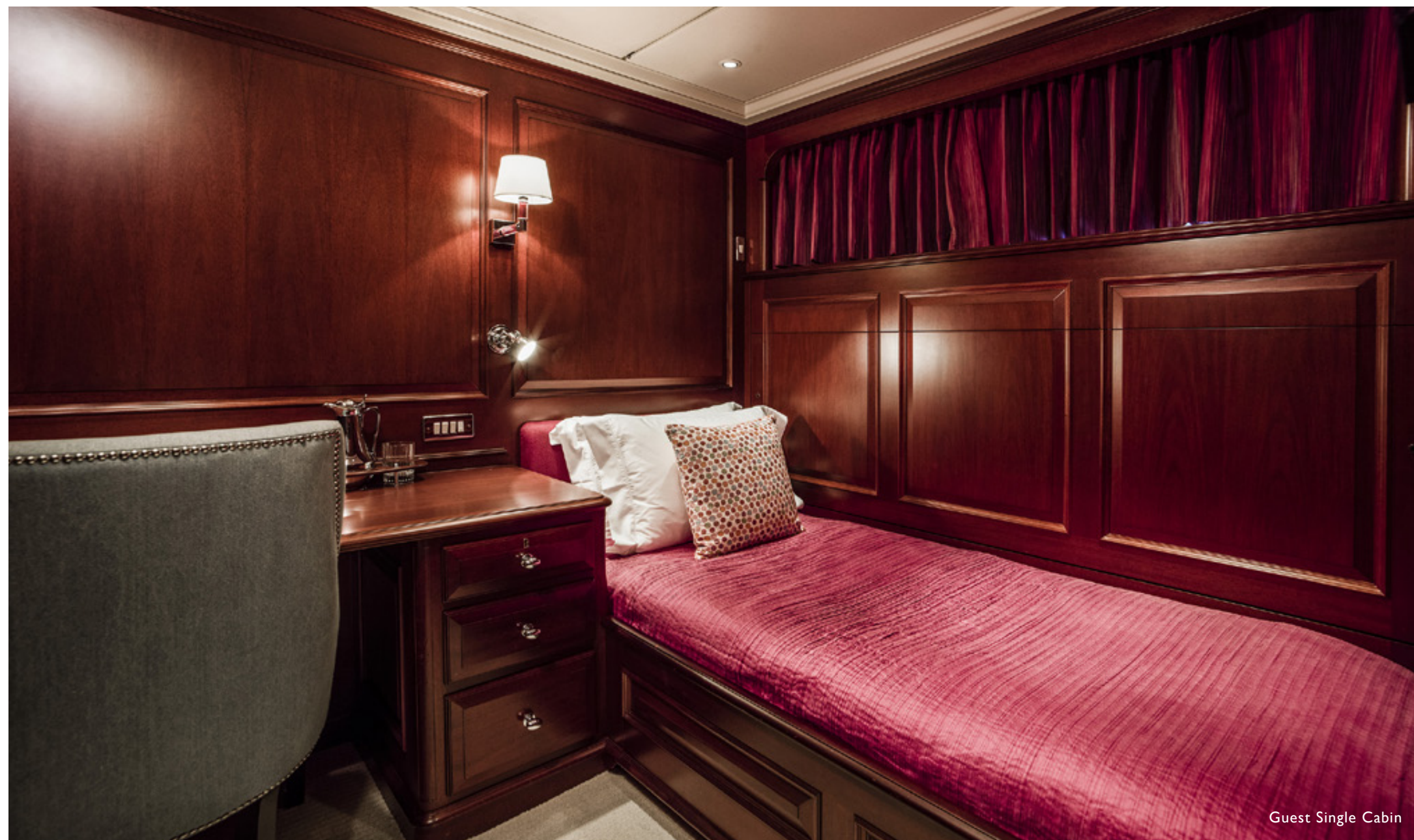
Guest Single Cabin