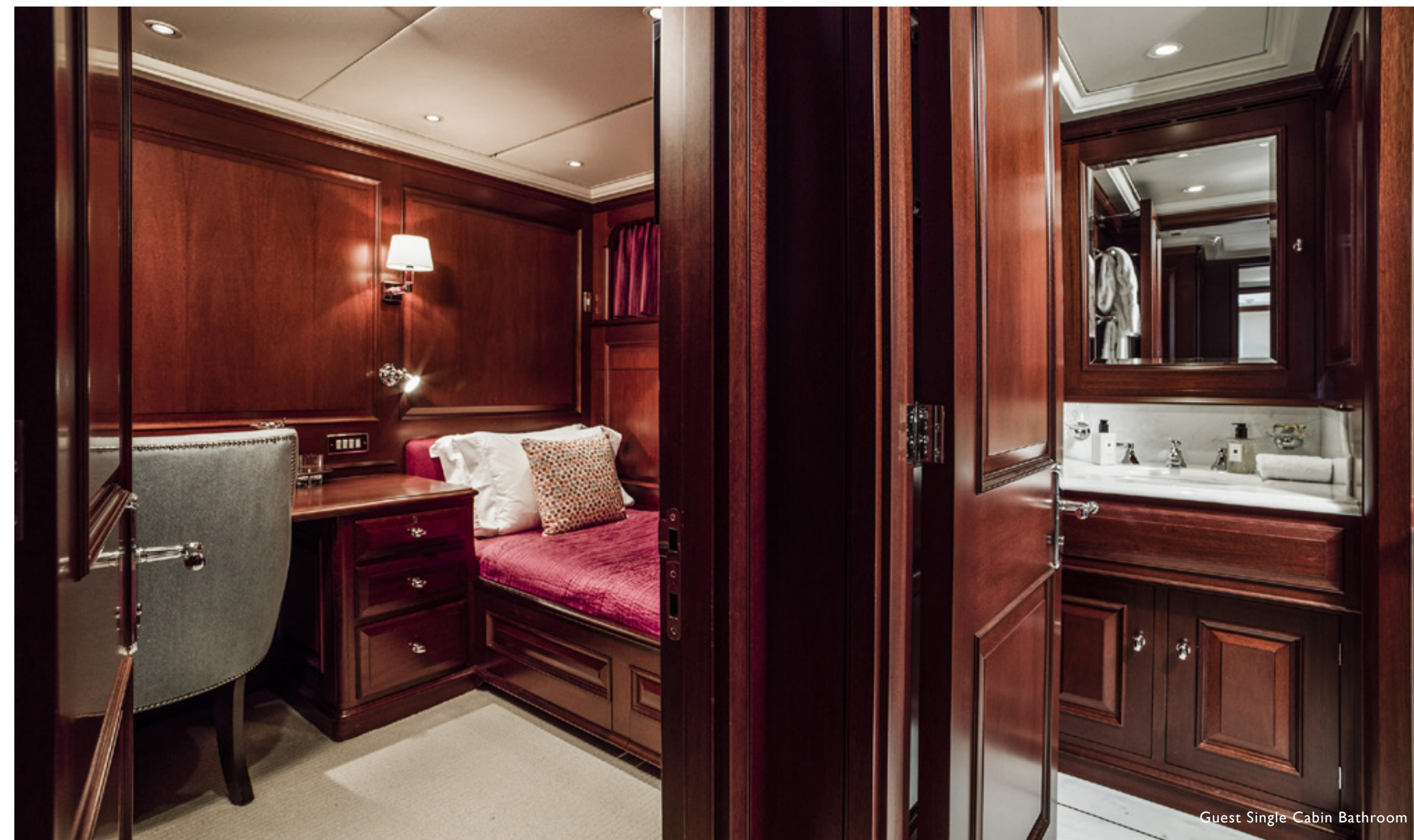
Guest Single Cabin Bathroom