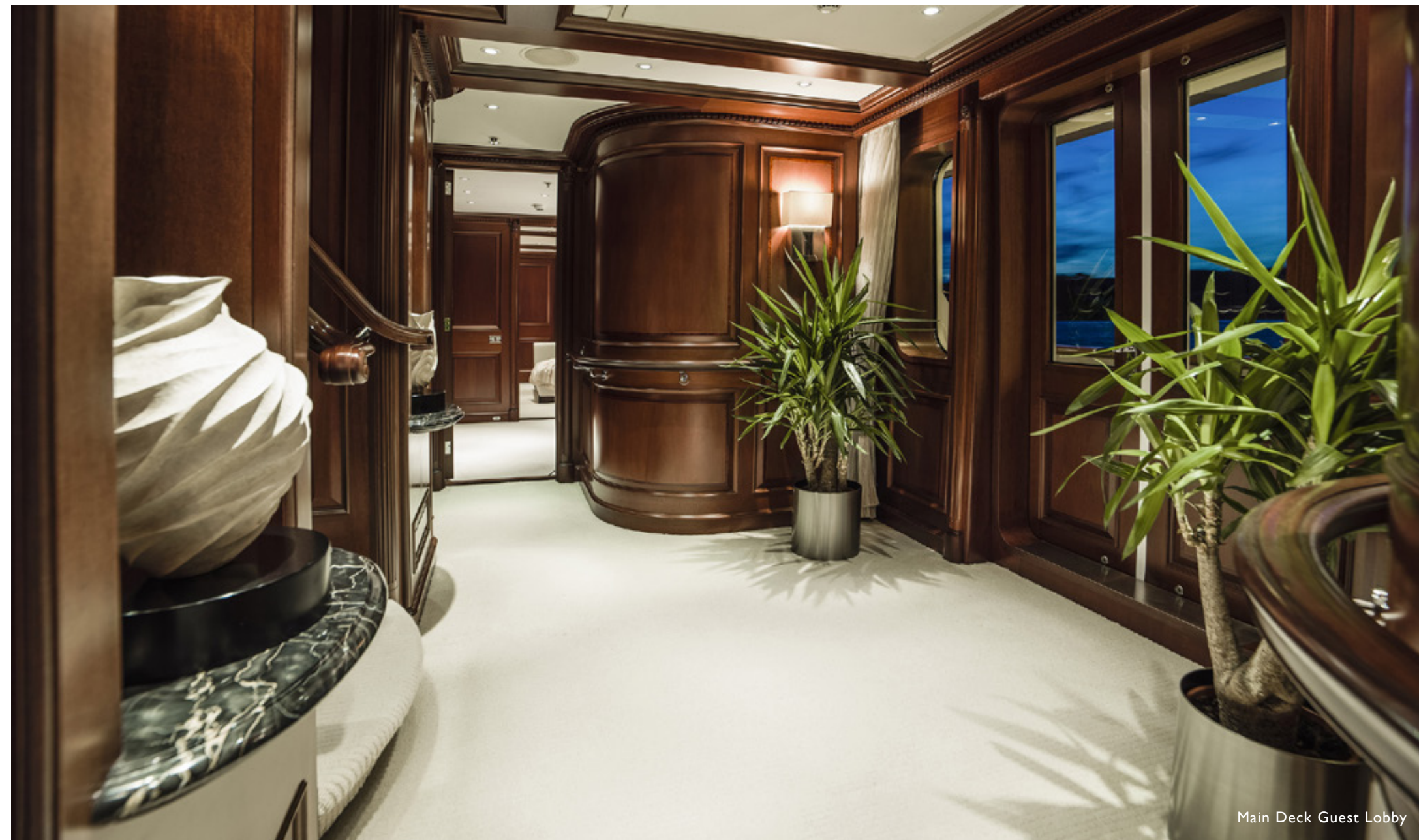
Main Deck Guest Lobby