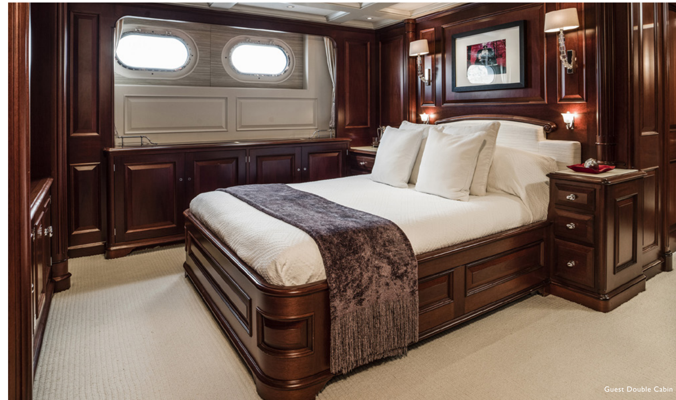
Guest Double Cabin