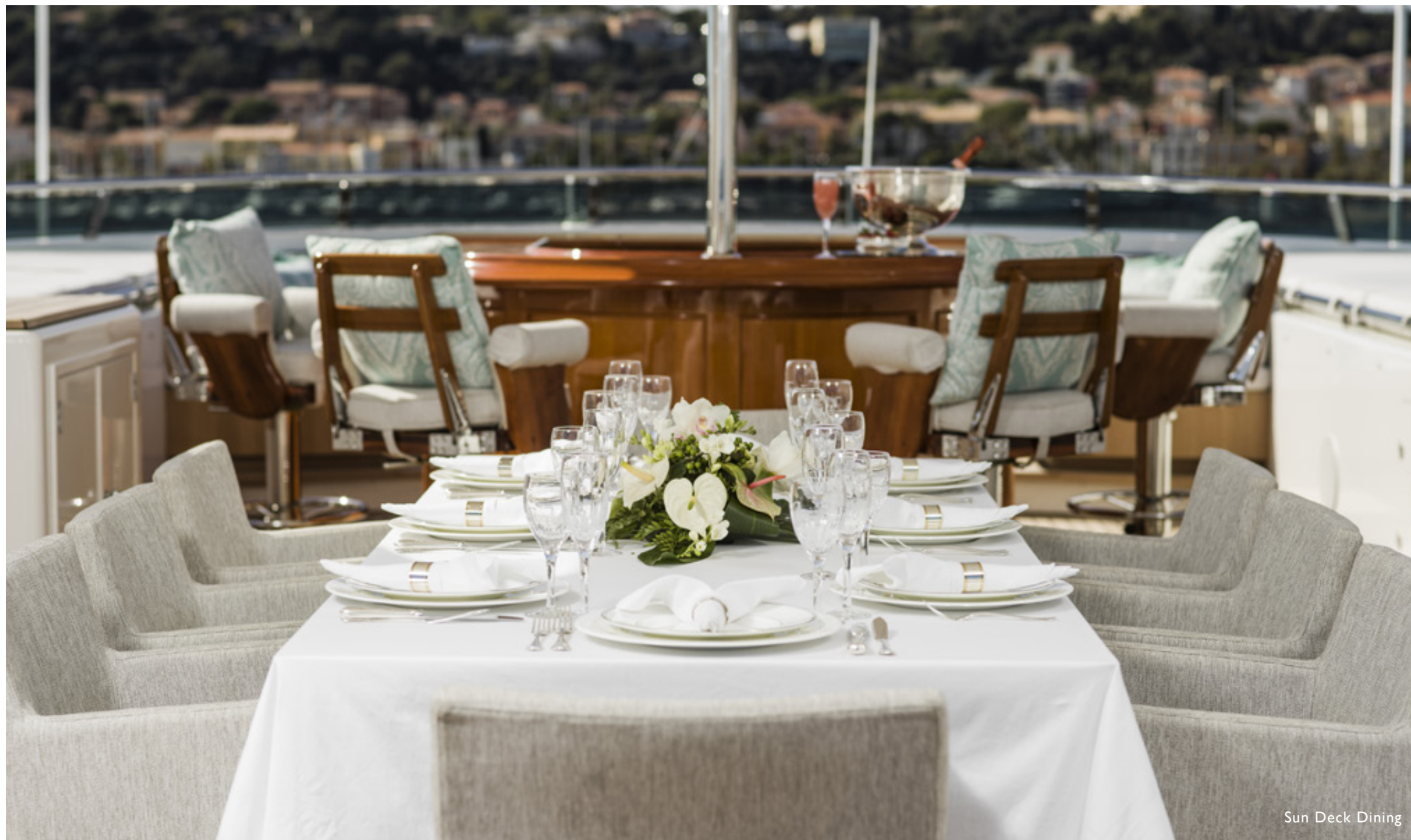
Sun Deck Dining