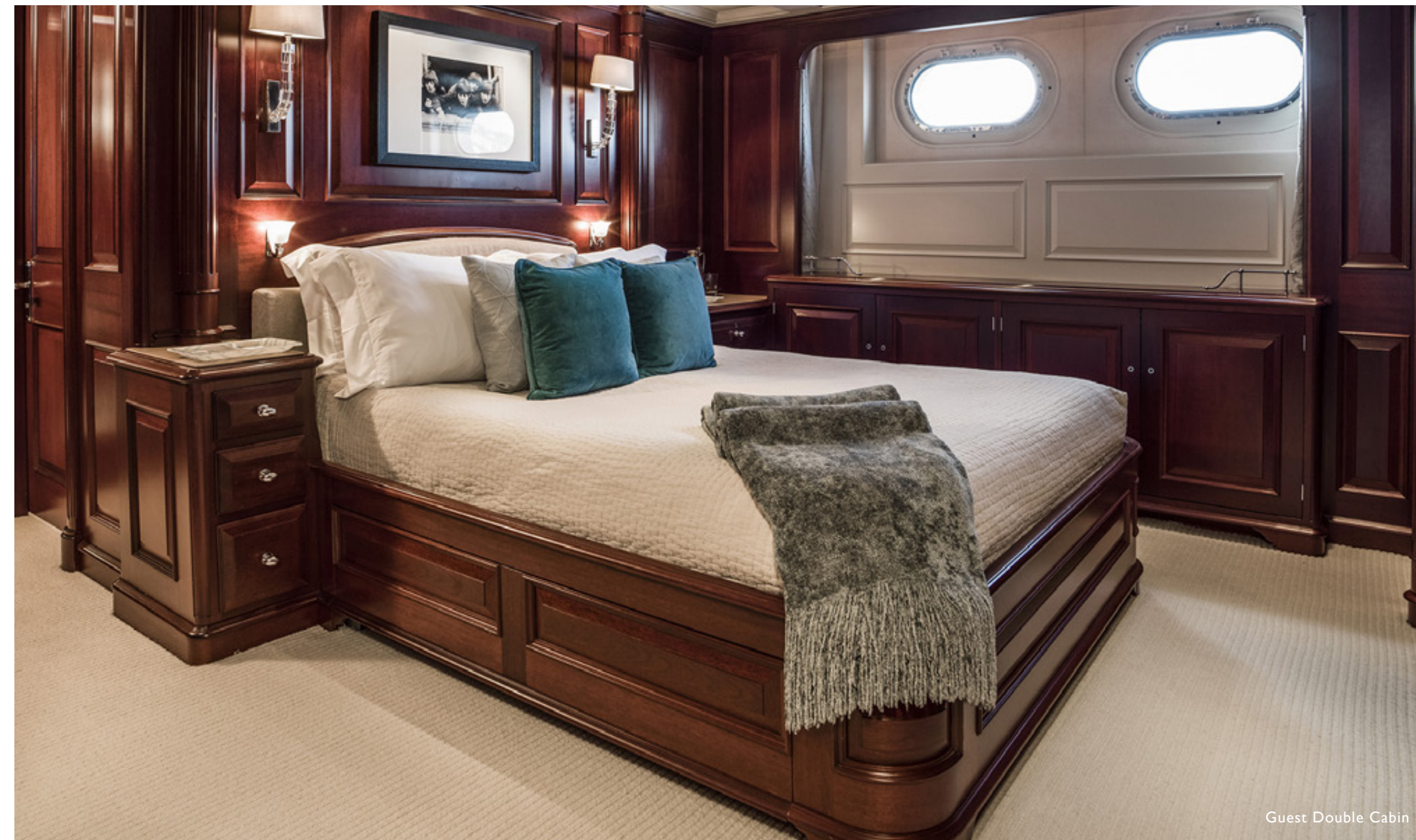
Guest Double Cabin