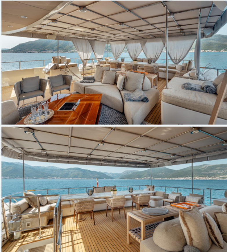
Exterior Decks & Dining