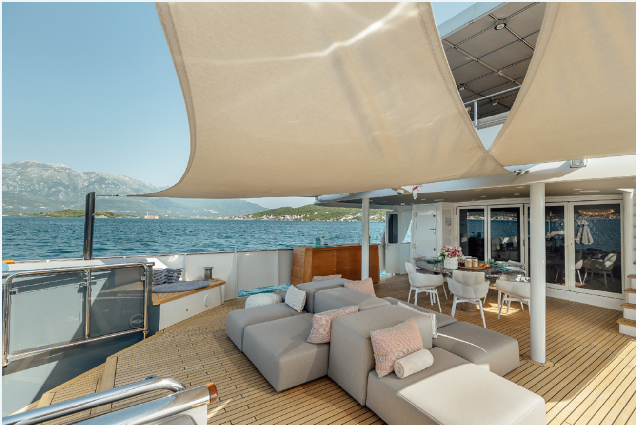
Exterior Decks & Dining