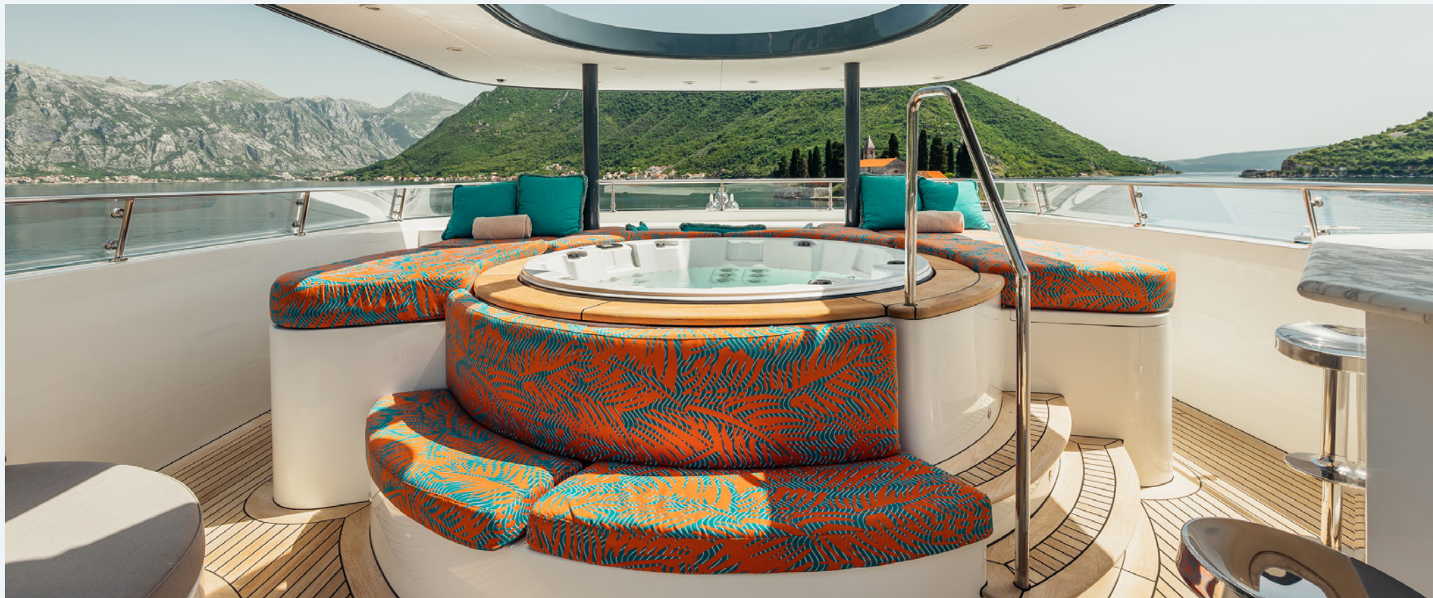
Exterior Decks / Jacuzzi