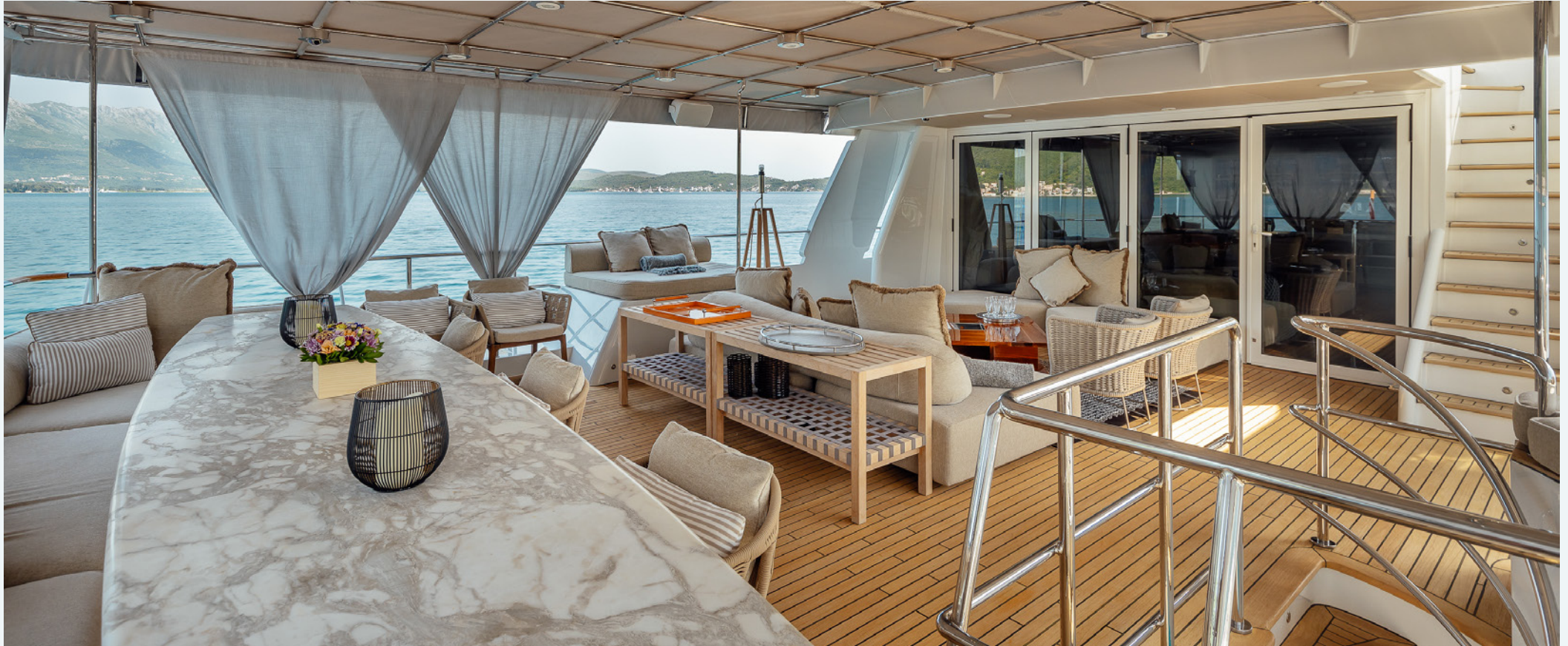
Exterior Decks & Dining