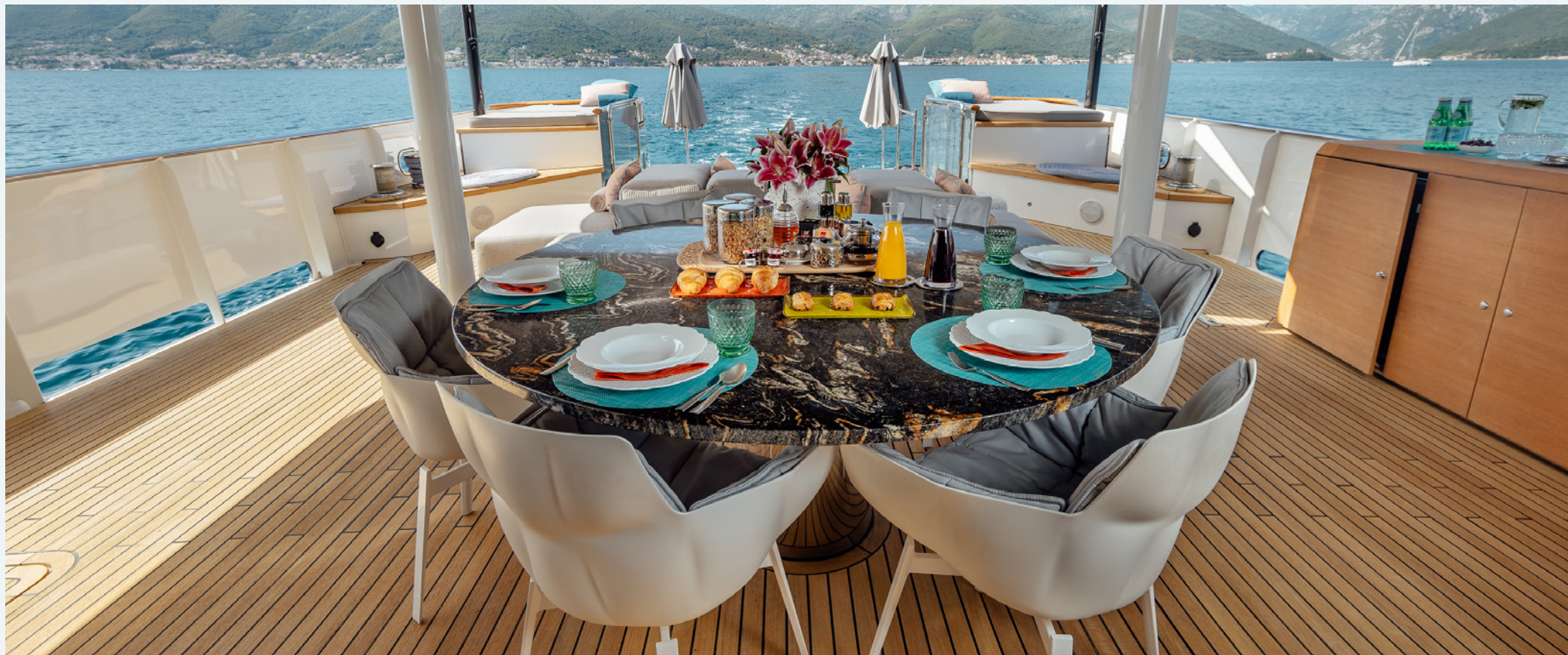
Exterior Decks & Dining