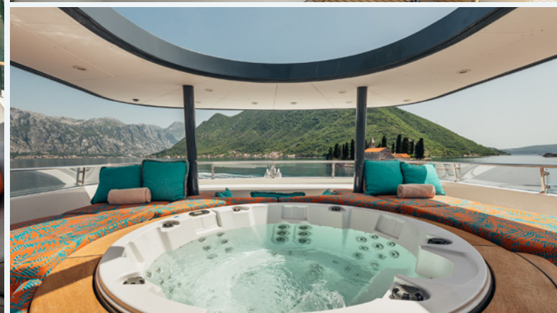
Exterior Decks / Jacuzzi