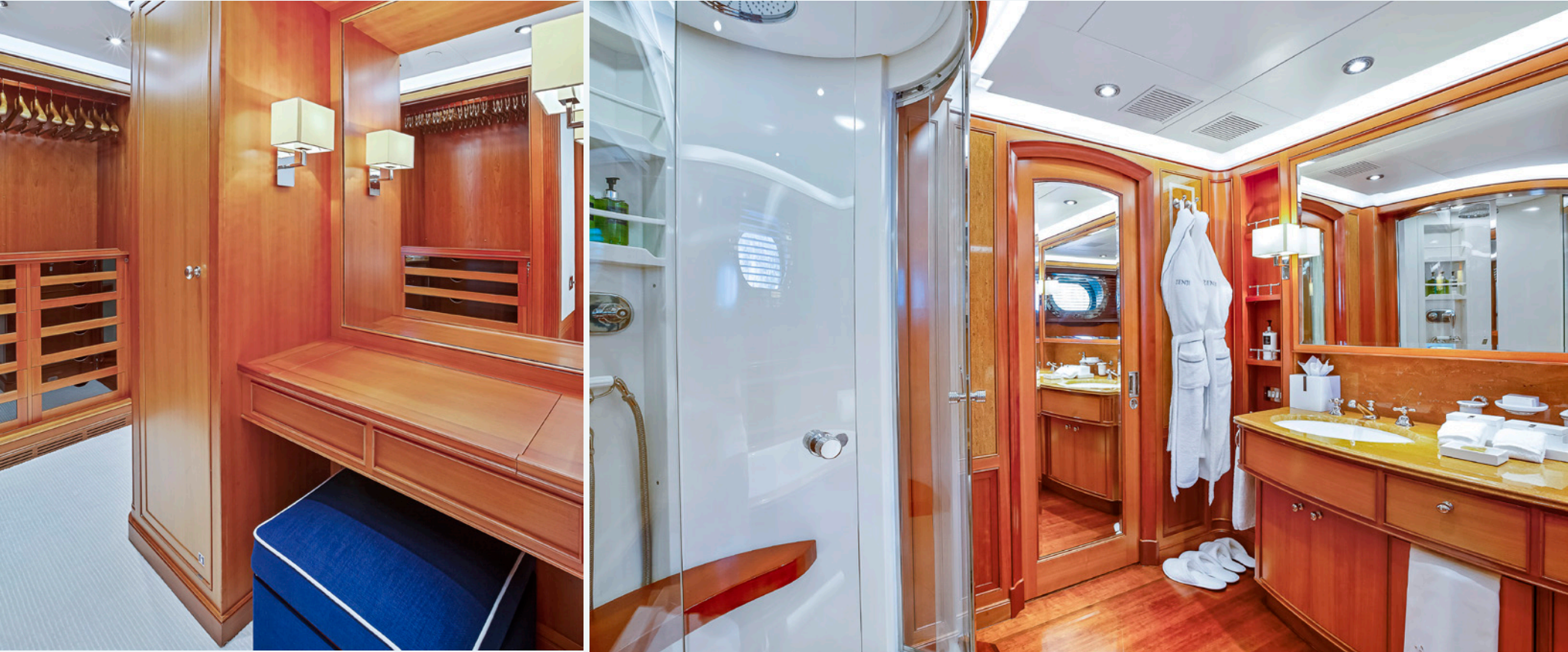
Master Stateroom Bathroom & Dressing Area