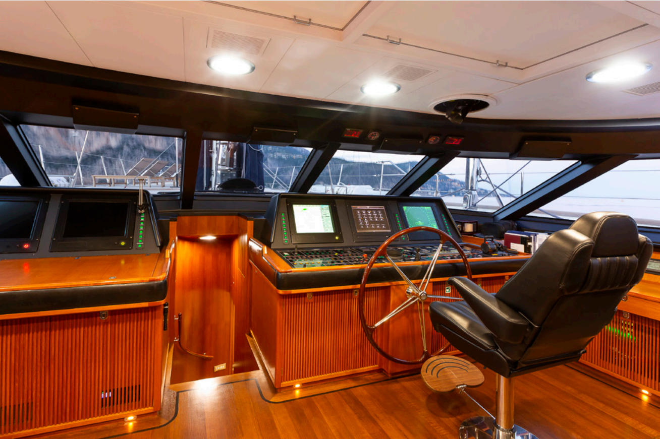
Bridge, Galley & Engine Room