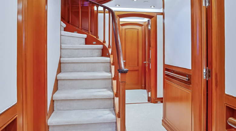
Salon & Hallway