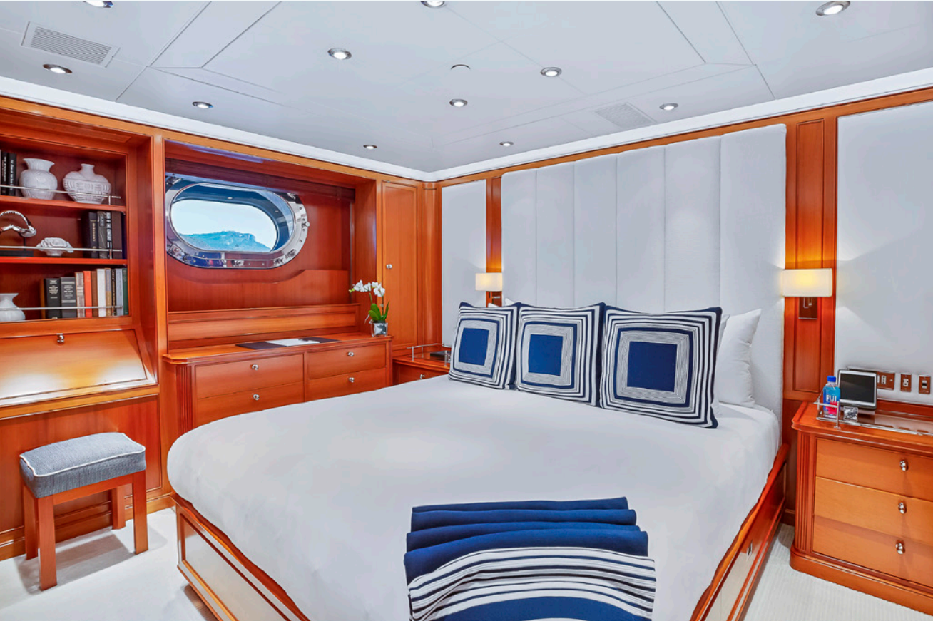
Guest Cabins & Bathroom