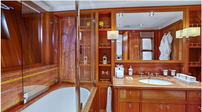
Guest Cabin & Bathroom