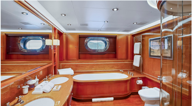
Master Stateroom & Bathroom