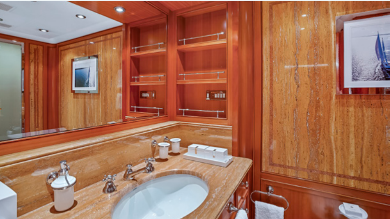
Guest Cabins & Bathroom