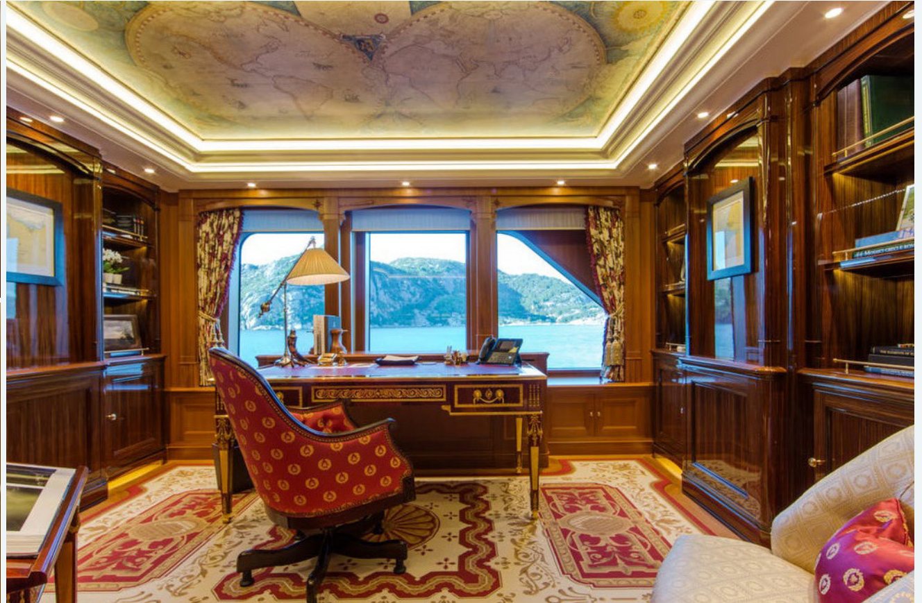
Study, Bathroom & Library