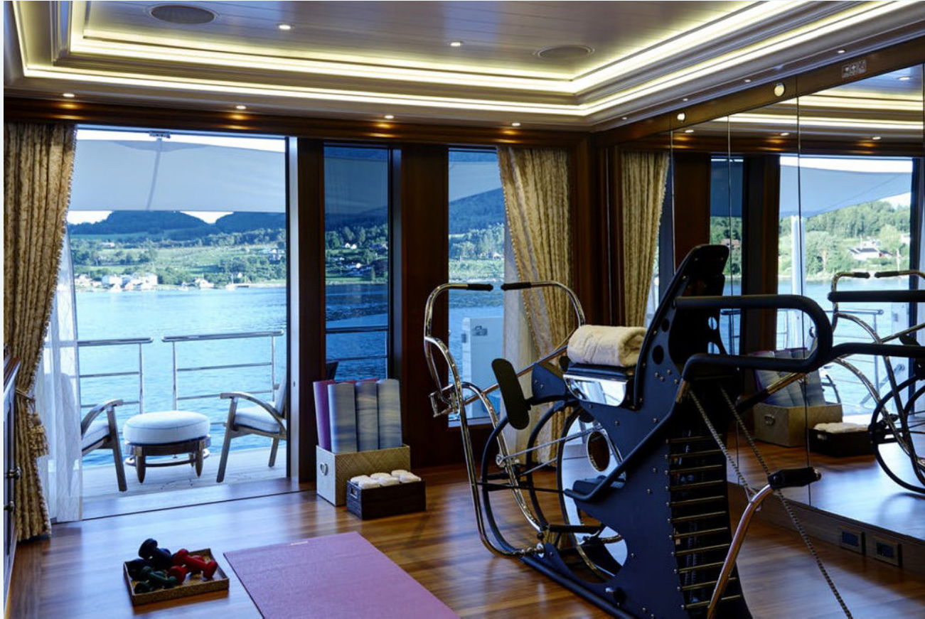
Gym, Bridge & Beach Club