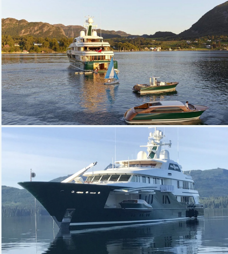
Tenders & Exterior Profile