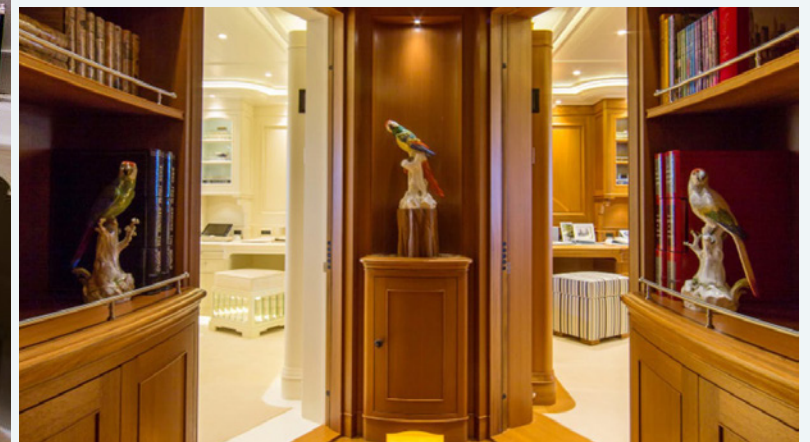
Guest Cabin, Bathroom & Corridor