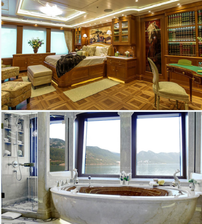
Sky Lounge, Master Stateroom & Bathroom