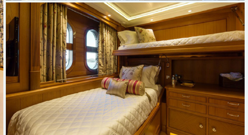
Guest Cabins & Bathroom