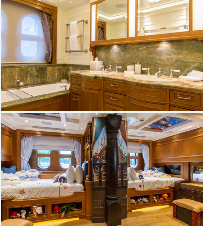
Guest Cabins & Bathroom