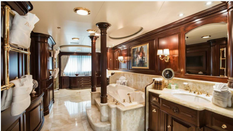
Master Stateroom, Bathroom & Office