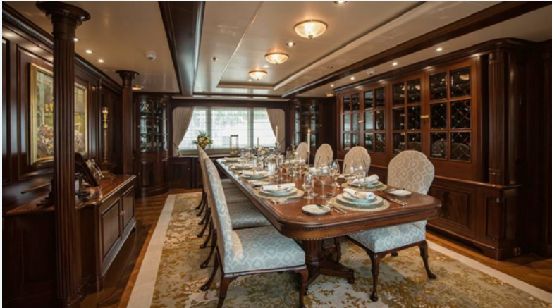
Main Salon & Dining