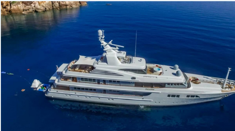
Toys & Exterior Profile