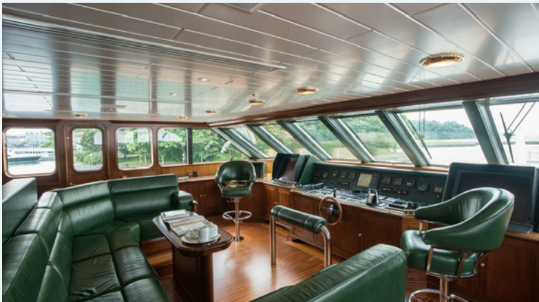
Guest Cabins & Bridge