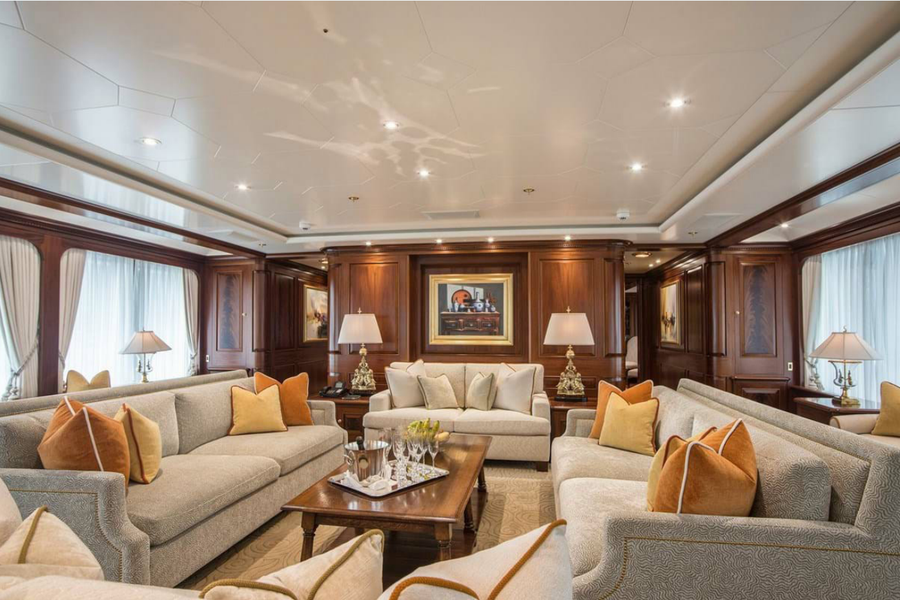
Sky Lounge, Bar & Gym