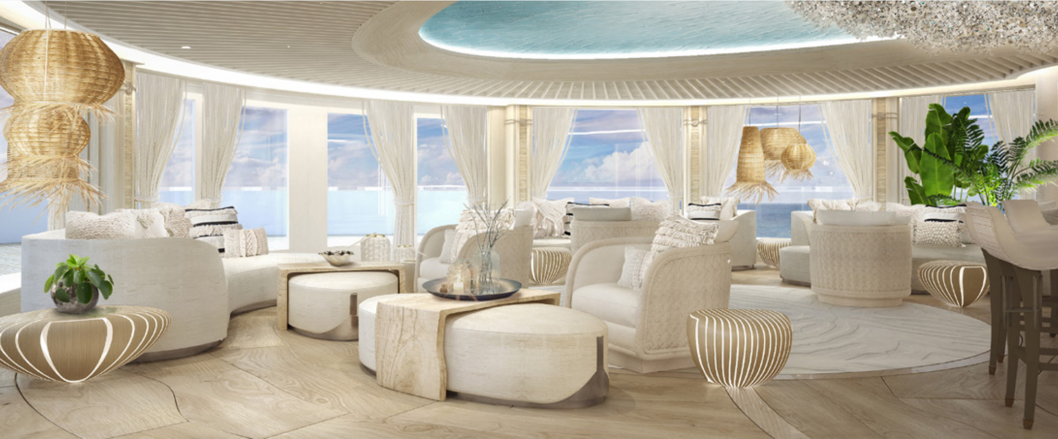
Pool Deck Salon