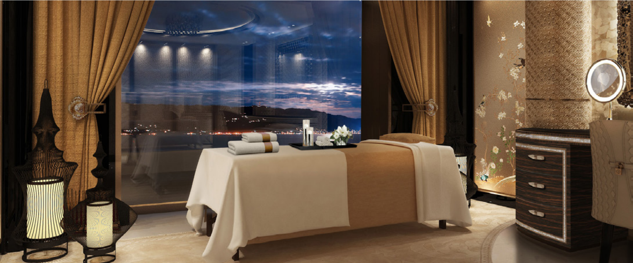
Master Suite Beauty Room