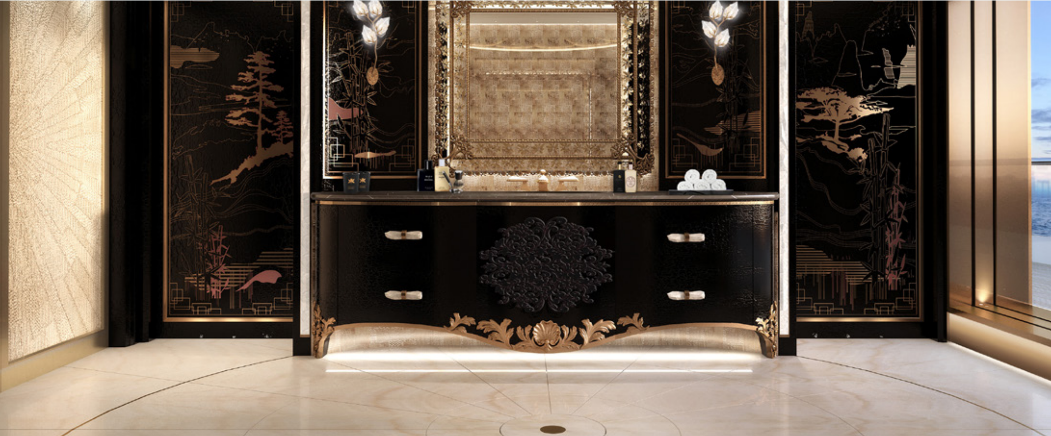
Master Suite His Bathroom