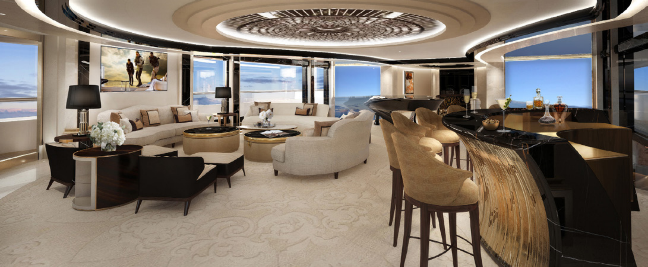
Upper Deck Salon