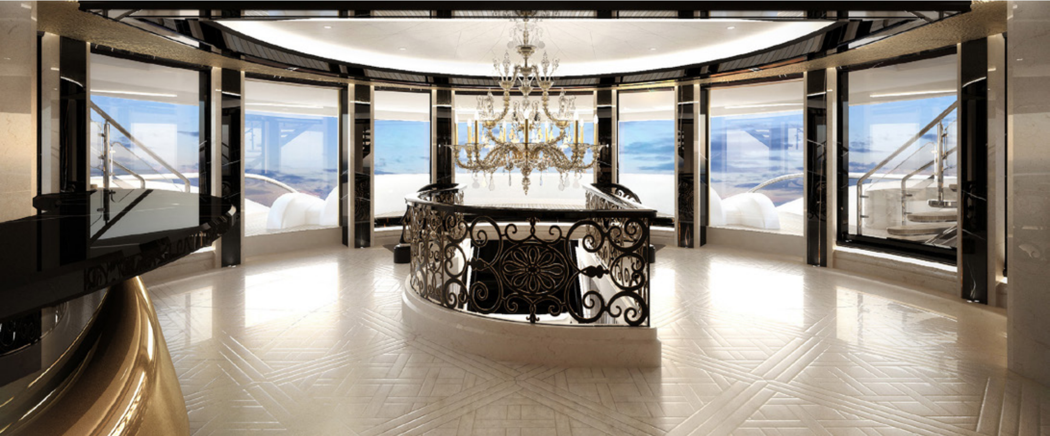
Upper Deck Foyer