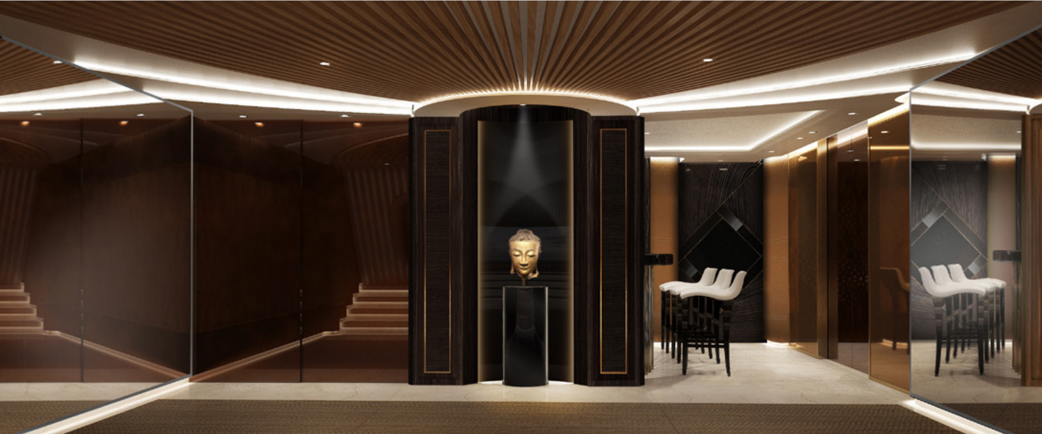
Yoga Room / Juice Bar