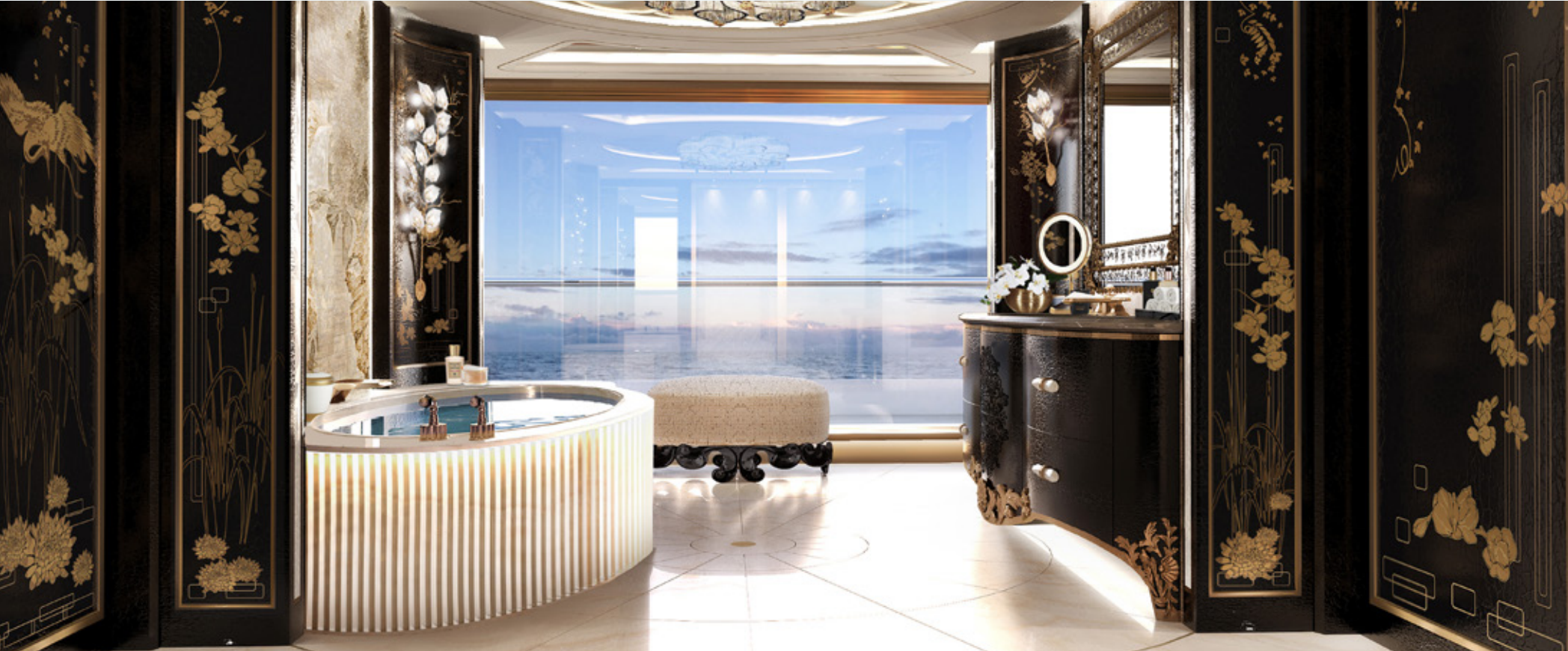
Master Suite Her Bathroom