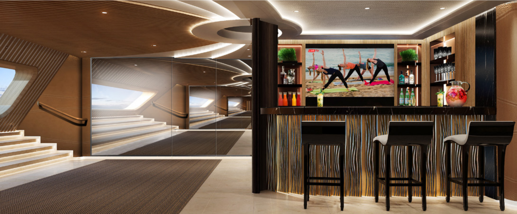
Yoga Room / Juice Bar