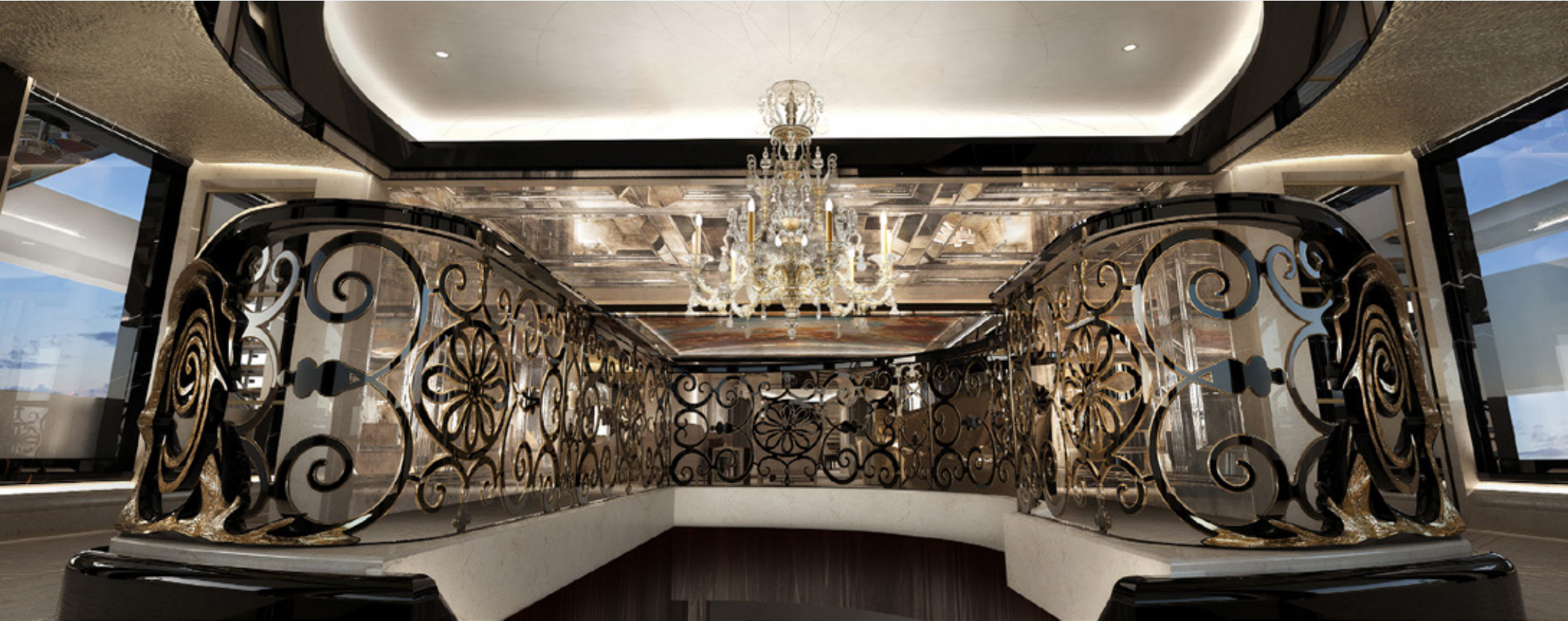
Upper Deck Foyer