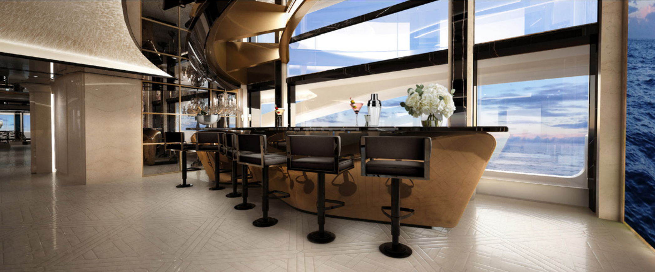
Main Deck Bar