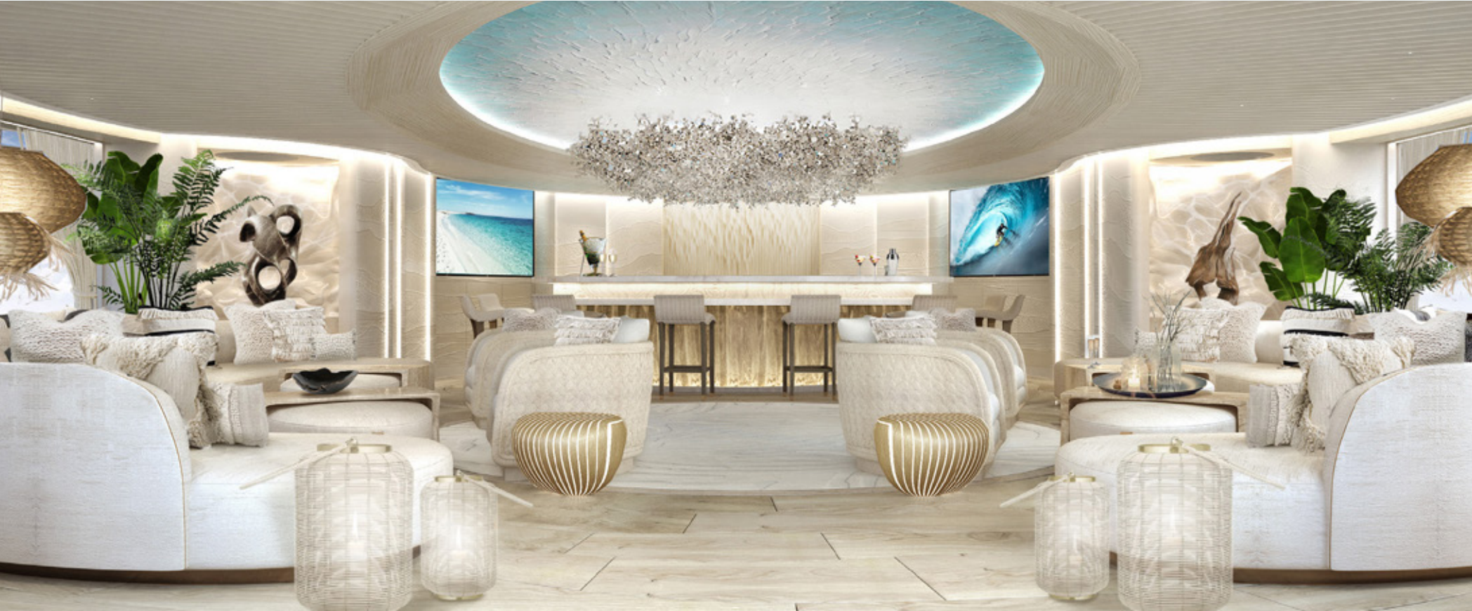
Pool Deck Salon