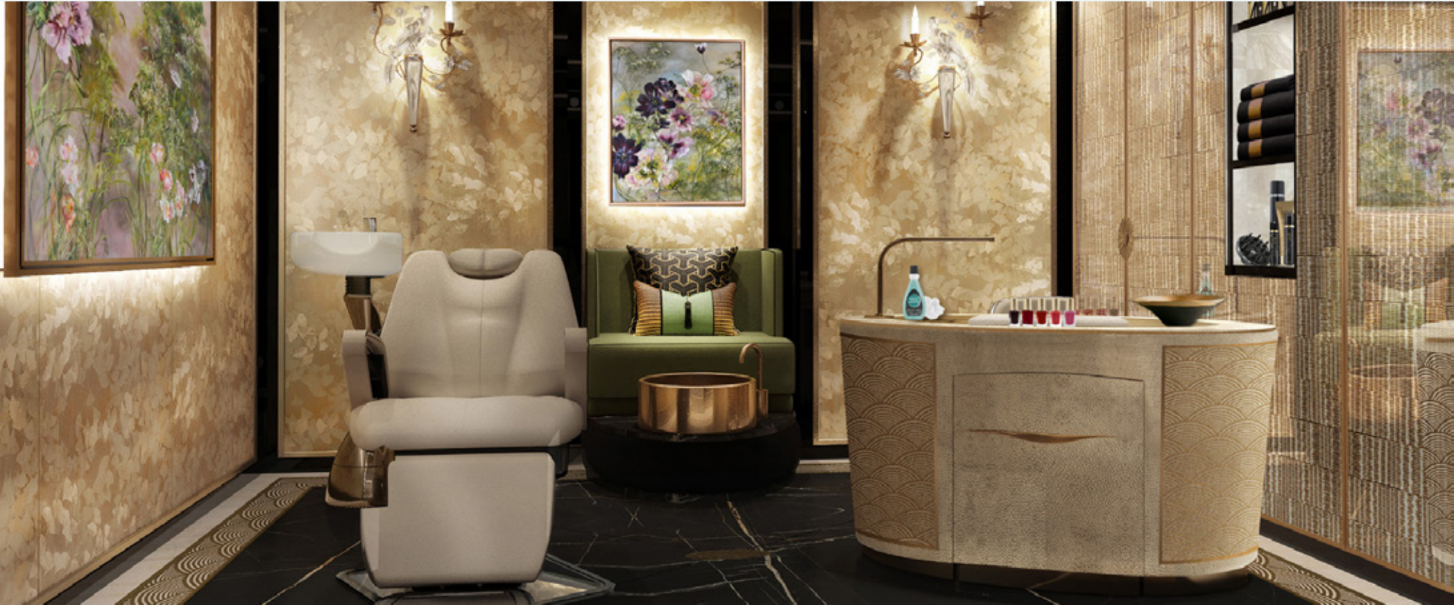
Master Suite Beauty Room