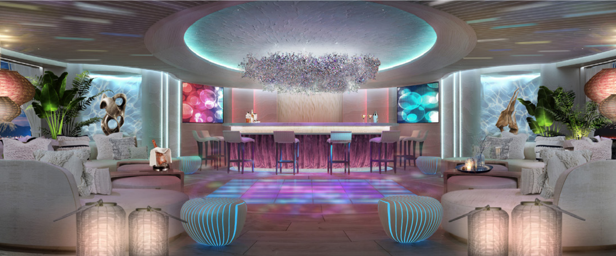
Pool Deck Salon