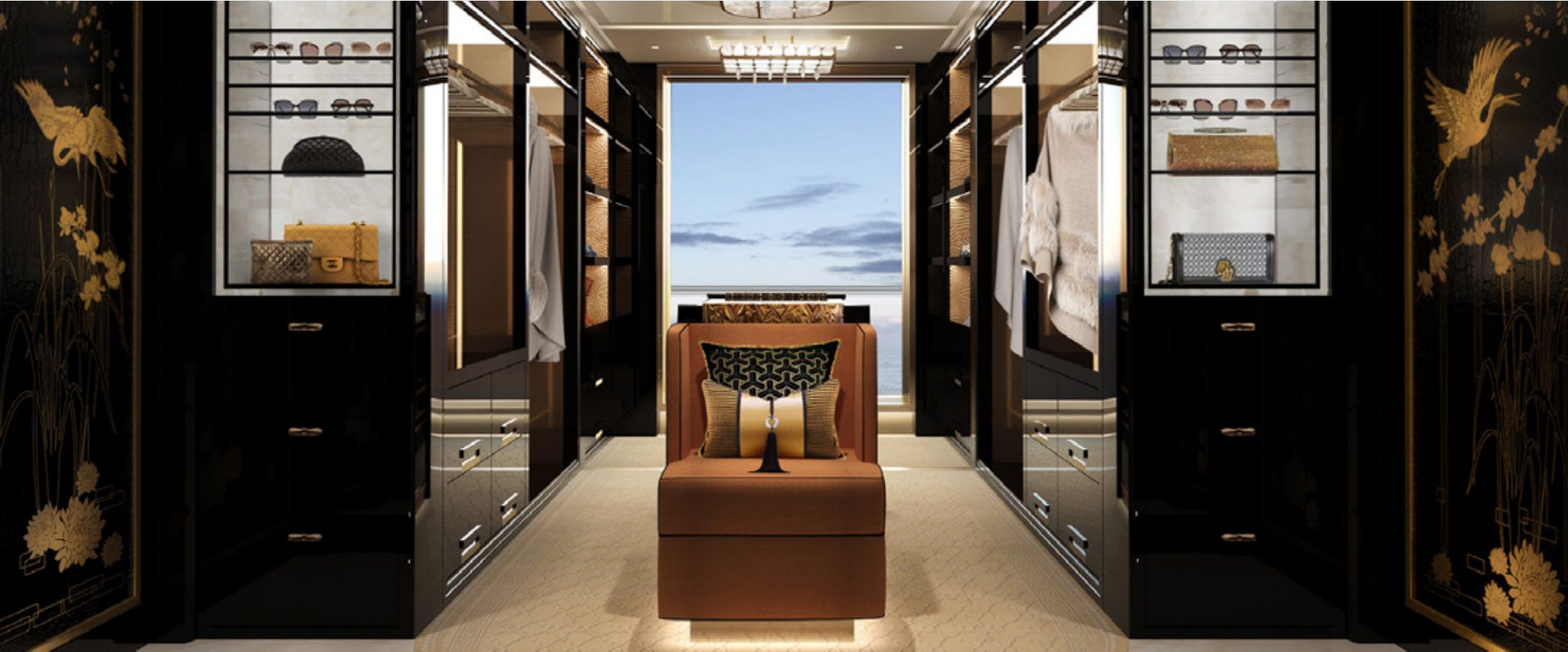
Master Suite His/Her Dressing Room