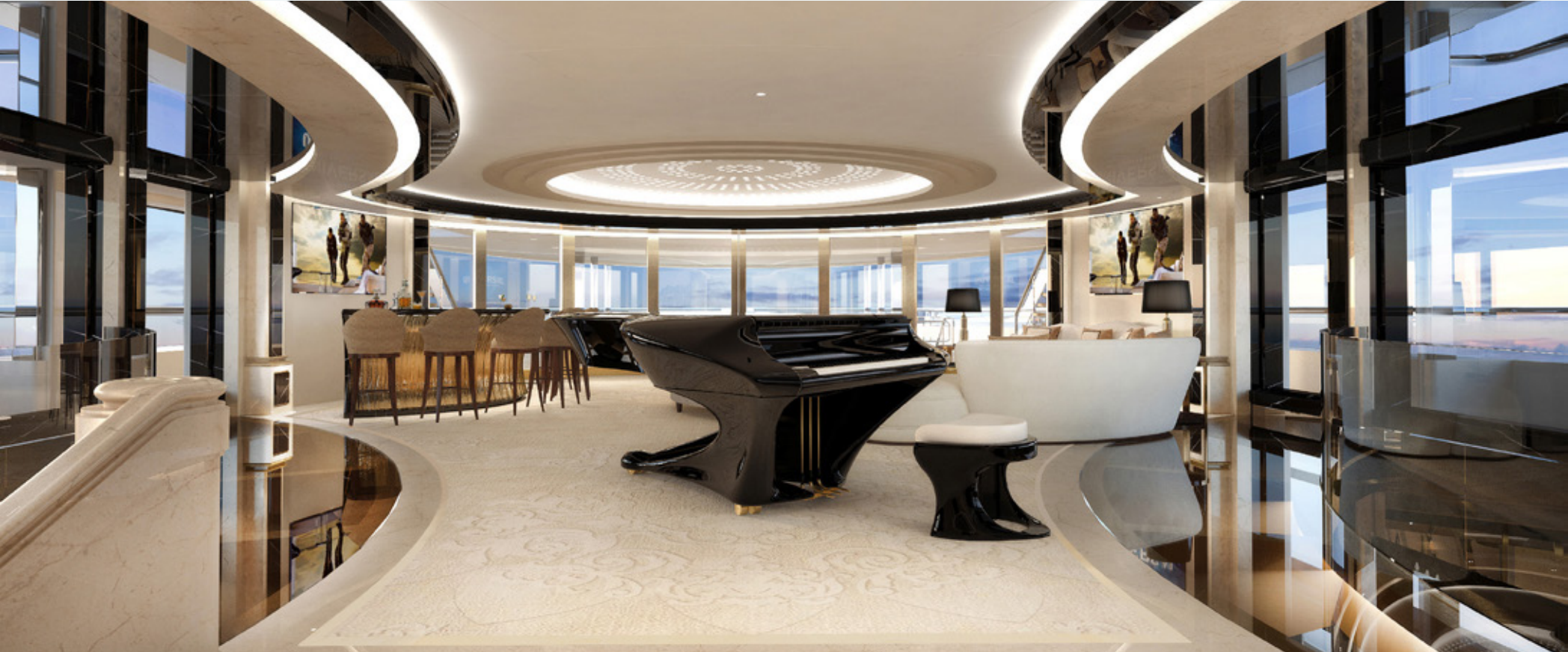
Upper Deck Salon