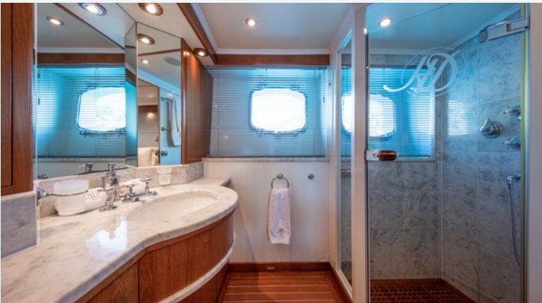
Master Stateroom & Bathroom