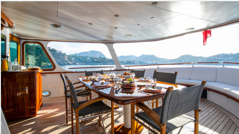
Guest Bathroom & Exterior Decks