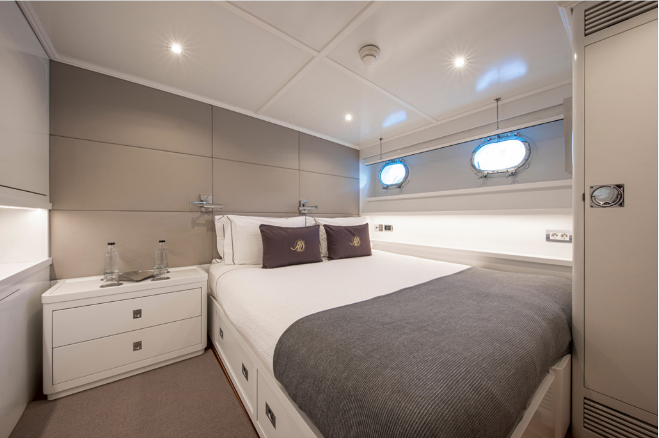
Guest Cabins & Bathroom