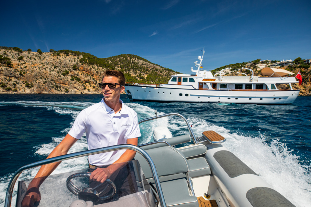
Tenders & Toys