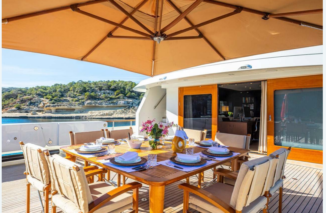
Bridge & Exterior Decks