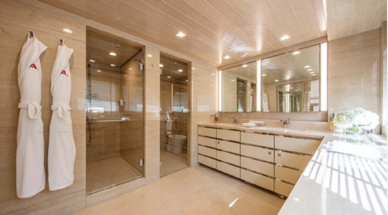
Master Stateroom & Bathroom