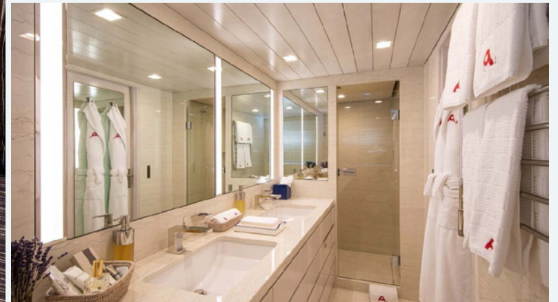
Guest Cabin & Bathroom