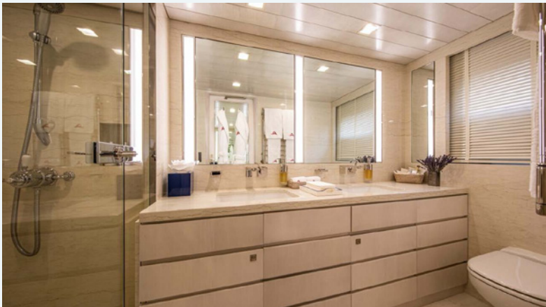
Guest Cabins & Bathroom