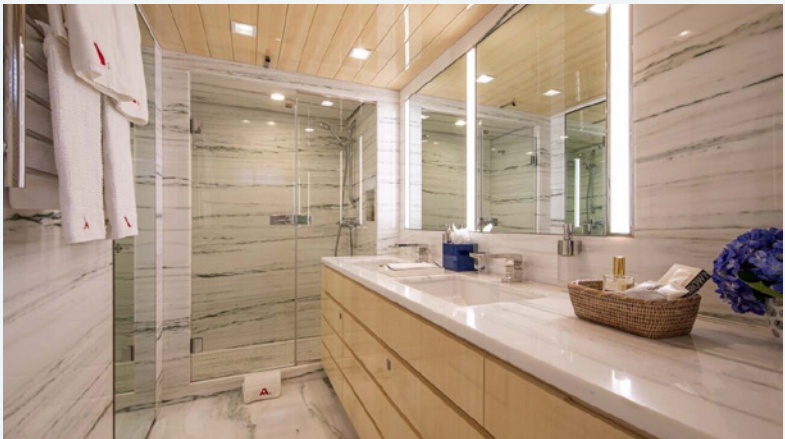
Guest Cabin & Bathroom