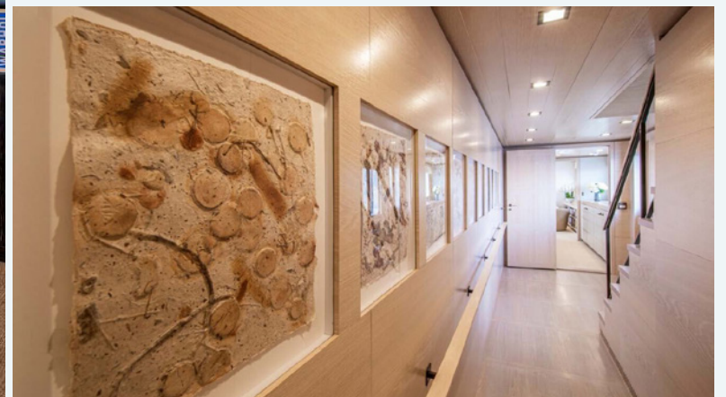
Sky Lounge & Hallway