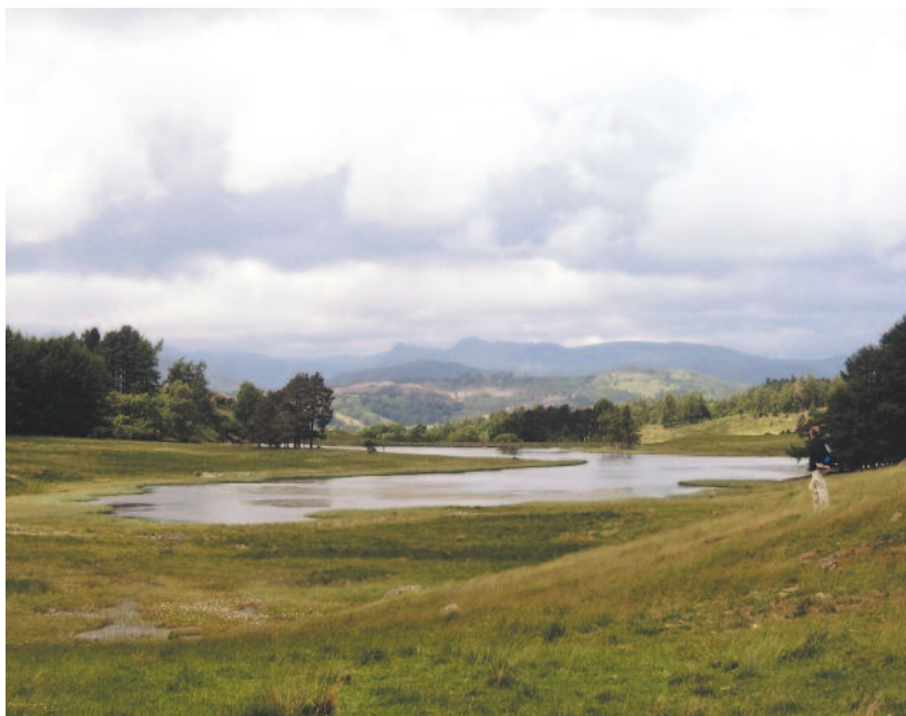
Wise Een Tarn